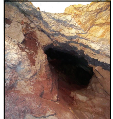
Grand Canyon Caverns is 20 stories underground!

It is his intention that the field trips will then be matched better to each student, making them even more motivating and relevant, as well as educational. Most field trips will involve visiting a college or trade school and showcase various careers.