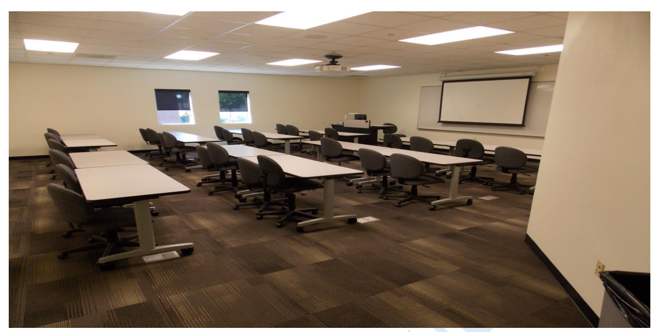
Refreshed Classroom 110