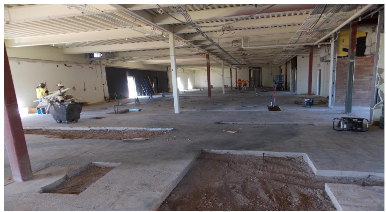
Concrete Sawing for Utilities Serving Science Labs on the First Floor