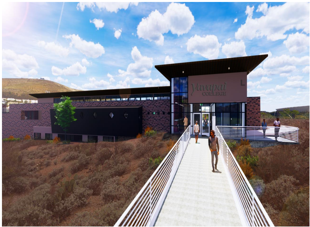
Rendering of Building L as Viewed from Building M

Please go to <a href="http://masterplan.yc.edu/">http://masterplan.yc.edu/</a> for more information about the campus master plan or implementation schedule. This site is updated regularly as new information concerning project progress becomes available.