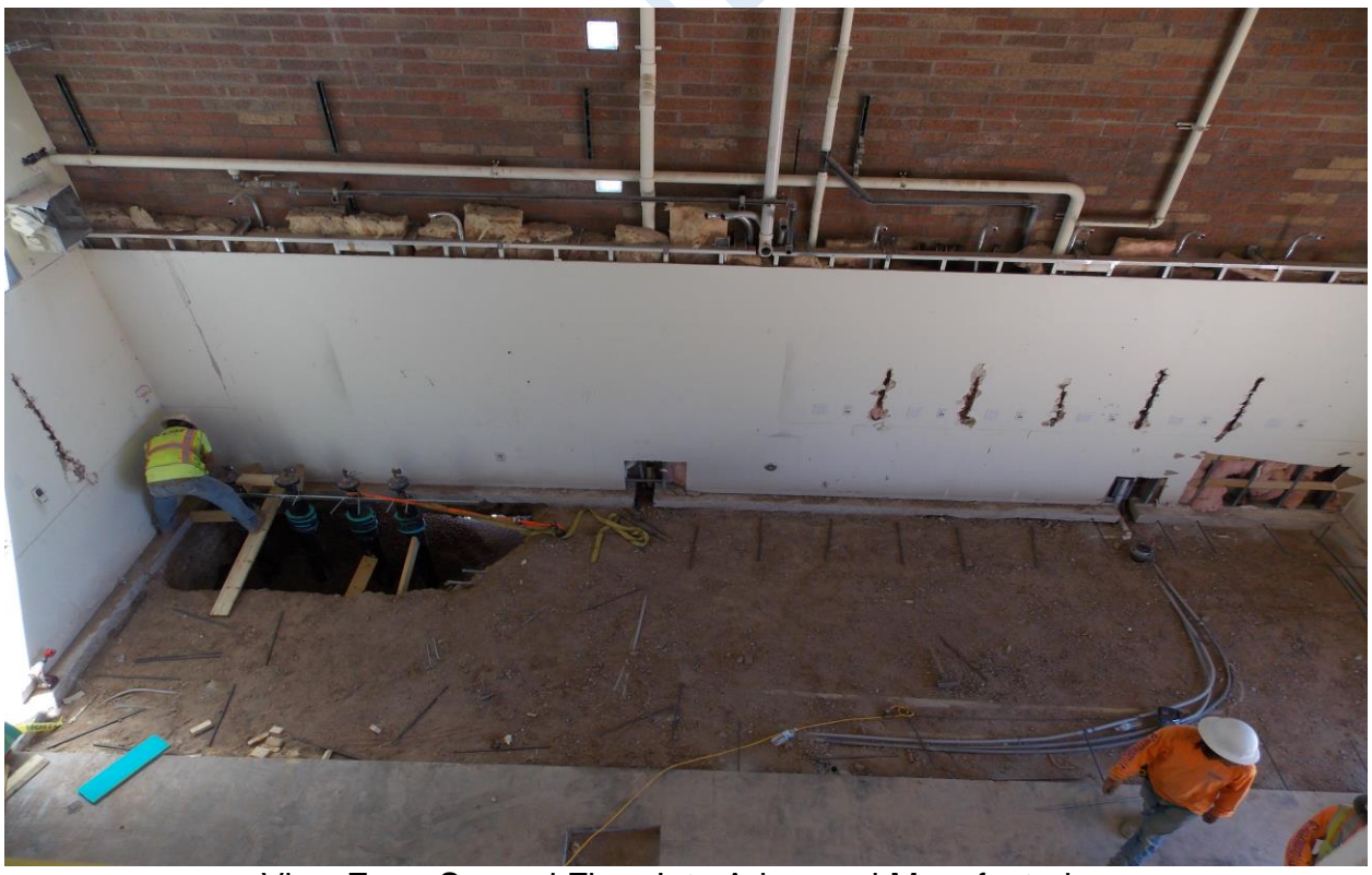
View From Second Floor Into Advanced Manufacturing