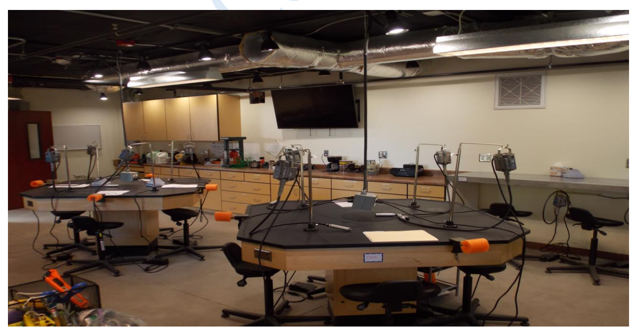
New Millwork and Counter Tops in Jewelry

Work at the Verde Valley campus related to the Building L moves is wrapping up with the completion of H-103 for Jewelry. Roof flashing will be installed the week of August 26.