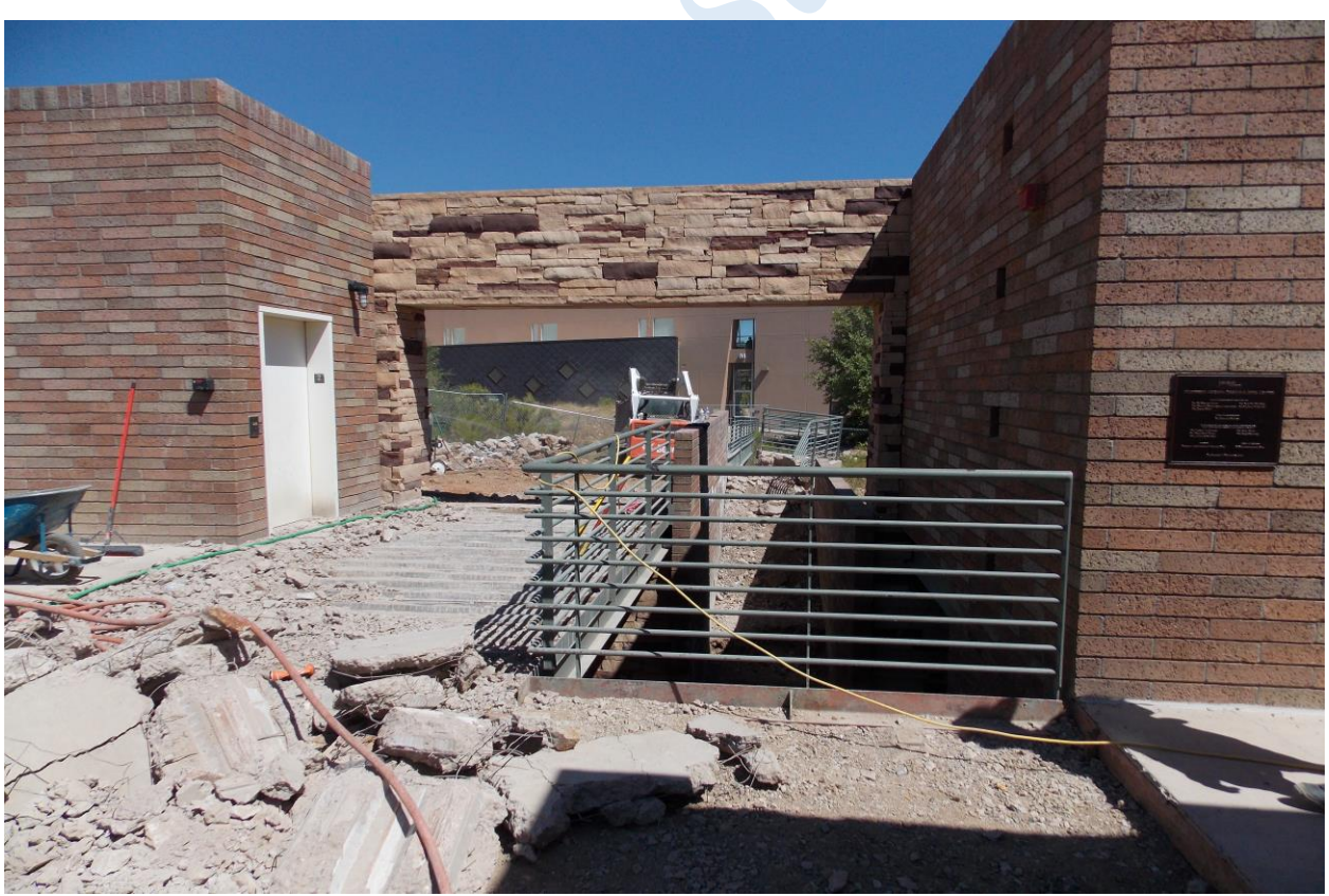
Demolition of West Stairwell and Bridge Approach to Building M