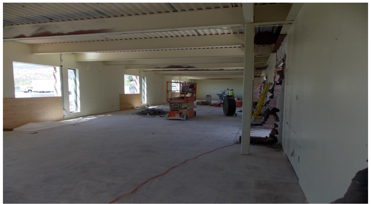
Second Floor Demolition