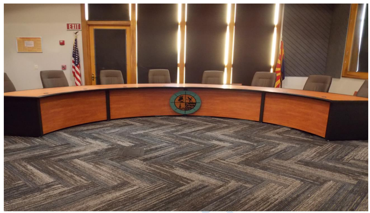
Facilities and ITS Preparing New DGB Table for Use