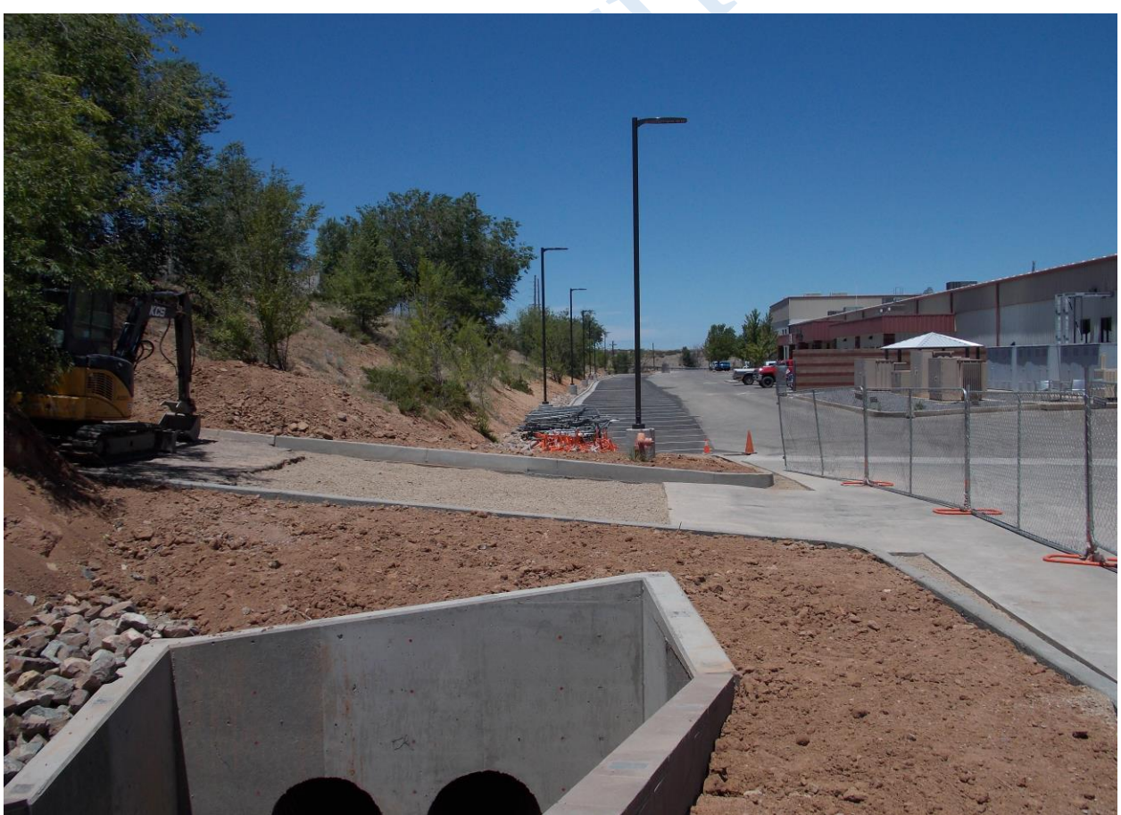
CTEC Site Drainage and Parking Lot Expansion Project