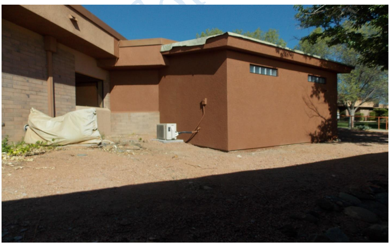
Jewelry Addition in Building H