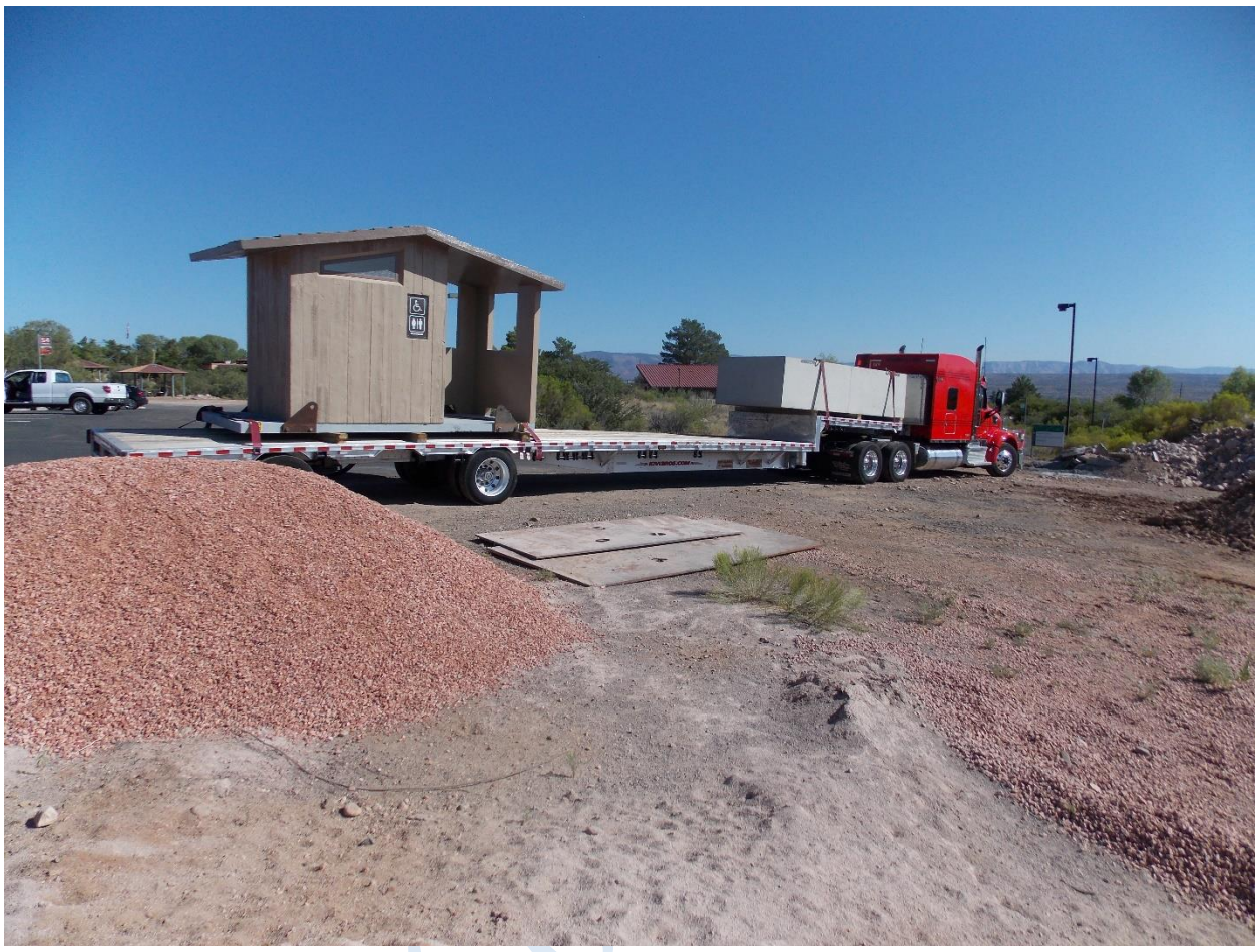
New Trail Head Restroom Being Delivered for Installtion by The Grounds Team