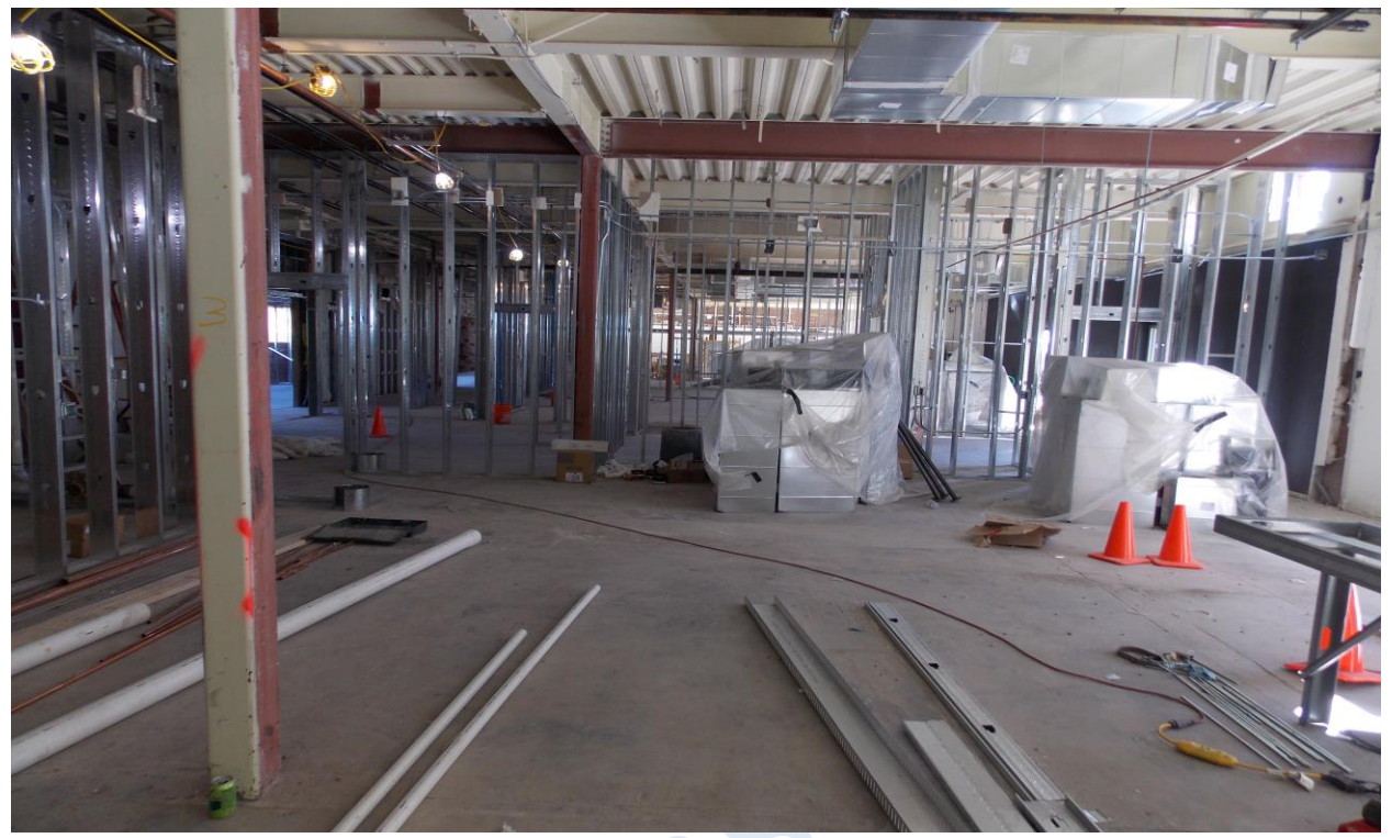
Electrical Rough-in and Mechanical Installation for Science Labs