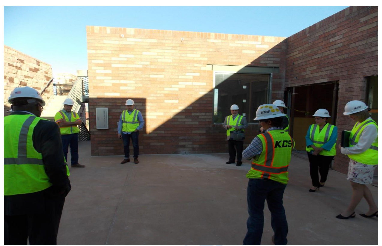
Discussing New Hallway Location during Executive Leadership Tour