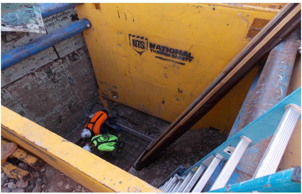
Excavation for Foundation Reinforcement