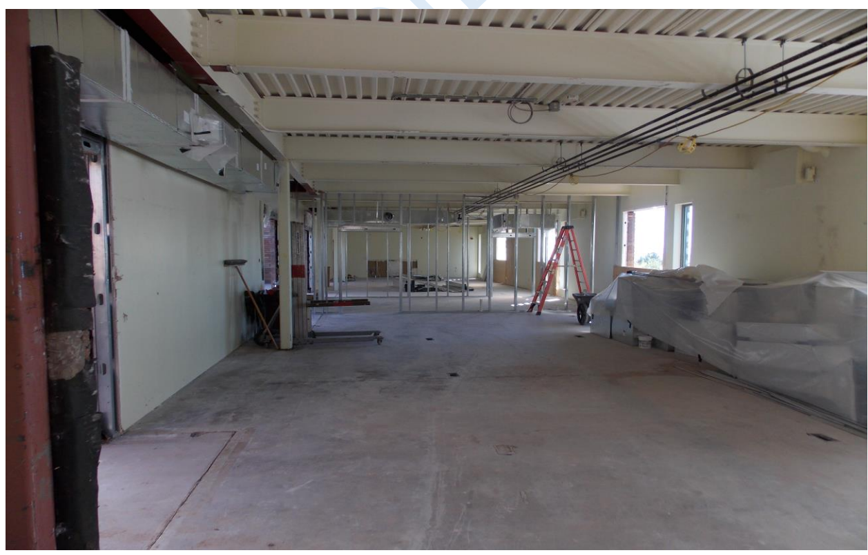
Water Recirculation Piping for Heating and Cooling