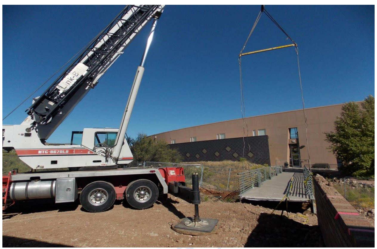
Lifting of Bridge between Buildings L and M for Structural Reinforcement