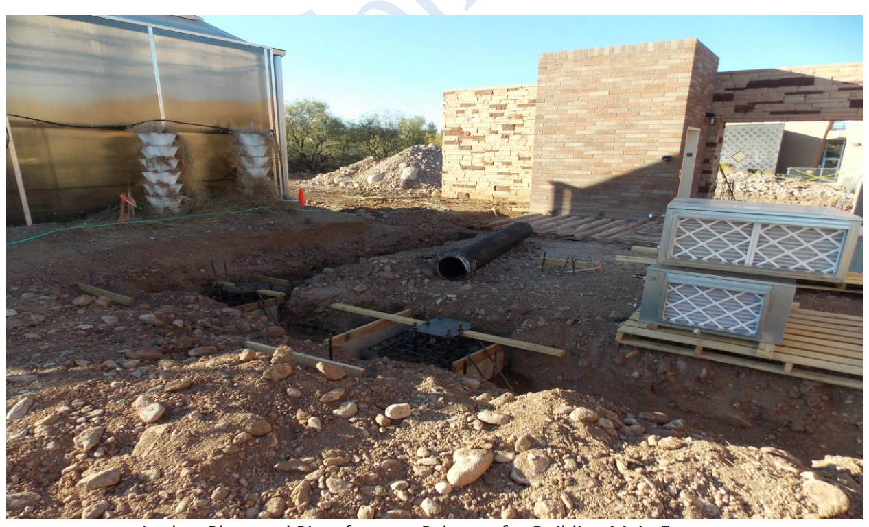
Anchor Plate and Piers for new Columns for Building Main Entrance