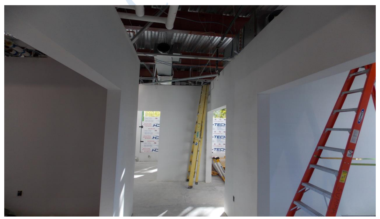
Installing Ductwork and Preparation for Ceiling Grid