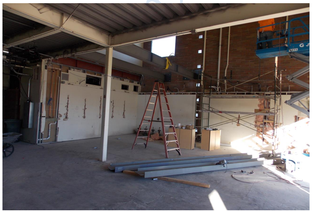
Structural Components for New Floor above Advanced Manufacturing Lab