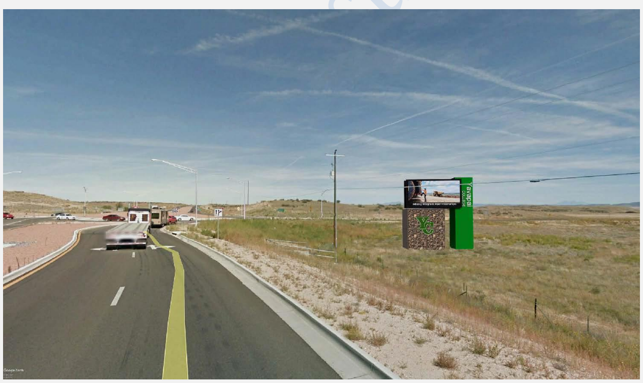
CTEC Highway 89 Possible Location Rendering

If you would like more information about the campus master plan or implementation schedule, please go to <a href="http://masterplan.yc.edu/">http://masterplan.yc.edu/</a>. This site is updated regularly as new information concerning project progress becomes available.