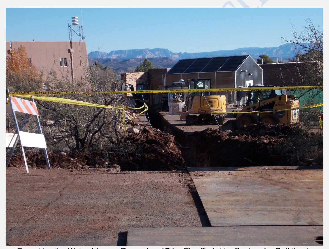
Trenching for Water Line on December 17 for Fire Sprinkler System for Building L

Design Team: SPS+ Architects Construction Team: Kinney Construction Services