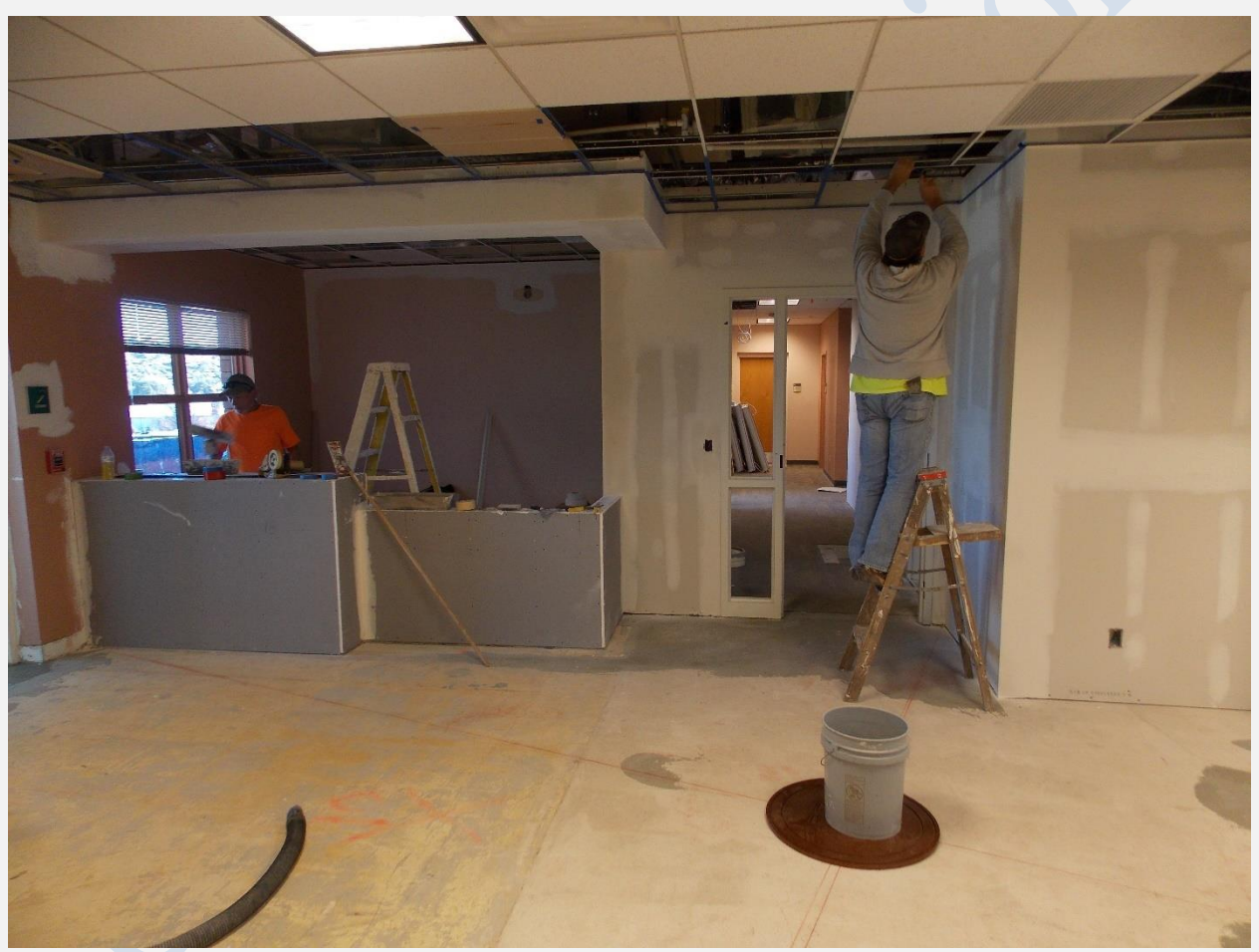
Lobby Prepped for New Flooring Building 32 and Reception Area

Kudos to David Franz of Ridgeline Builders for helping the Facilities team complete these critical tasks during the break. The remaining renovation of the east side of 32 will wrap up on or about March 3.