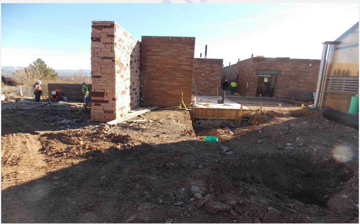
Concrete Forming for Meeting Room, Hallway and Office Space