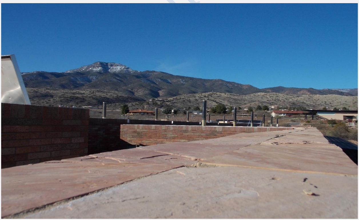
Piering for New Roof Structure