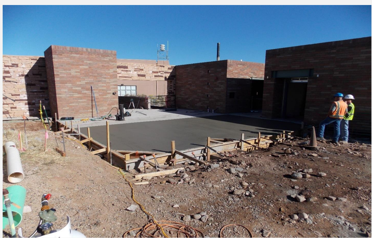
Concrete Poured for Front Entrance