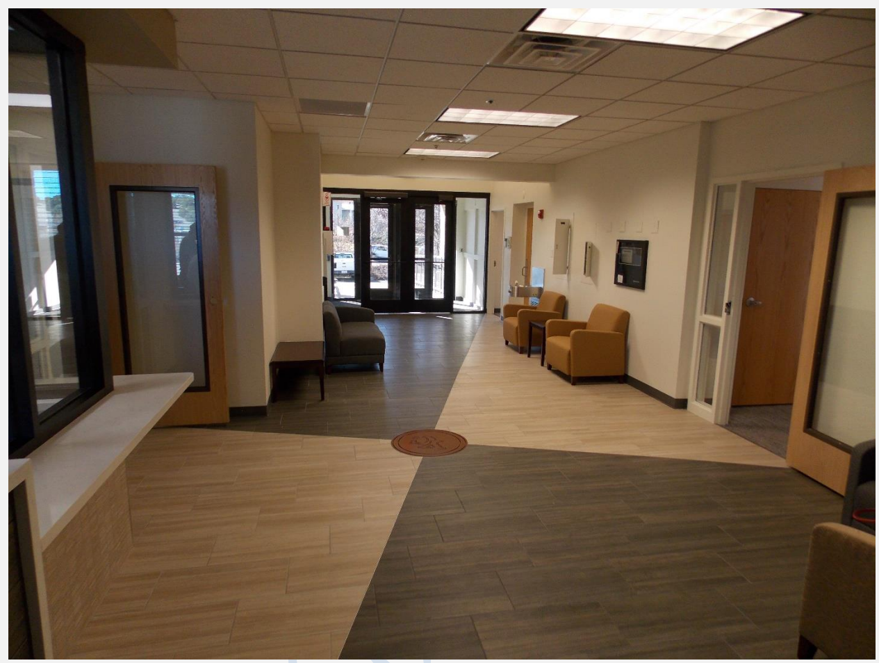
Building 32 Lobby