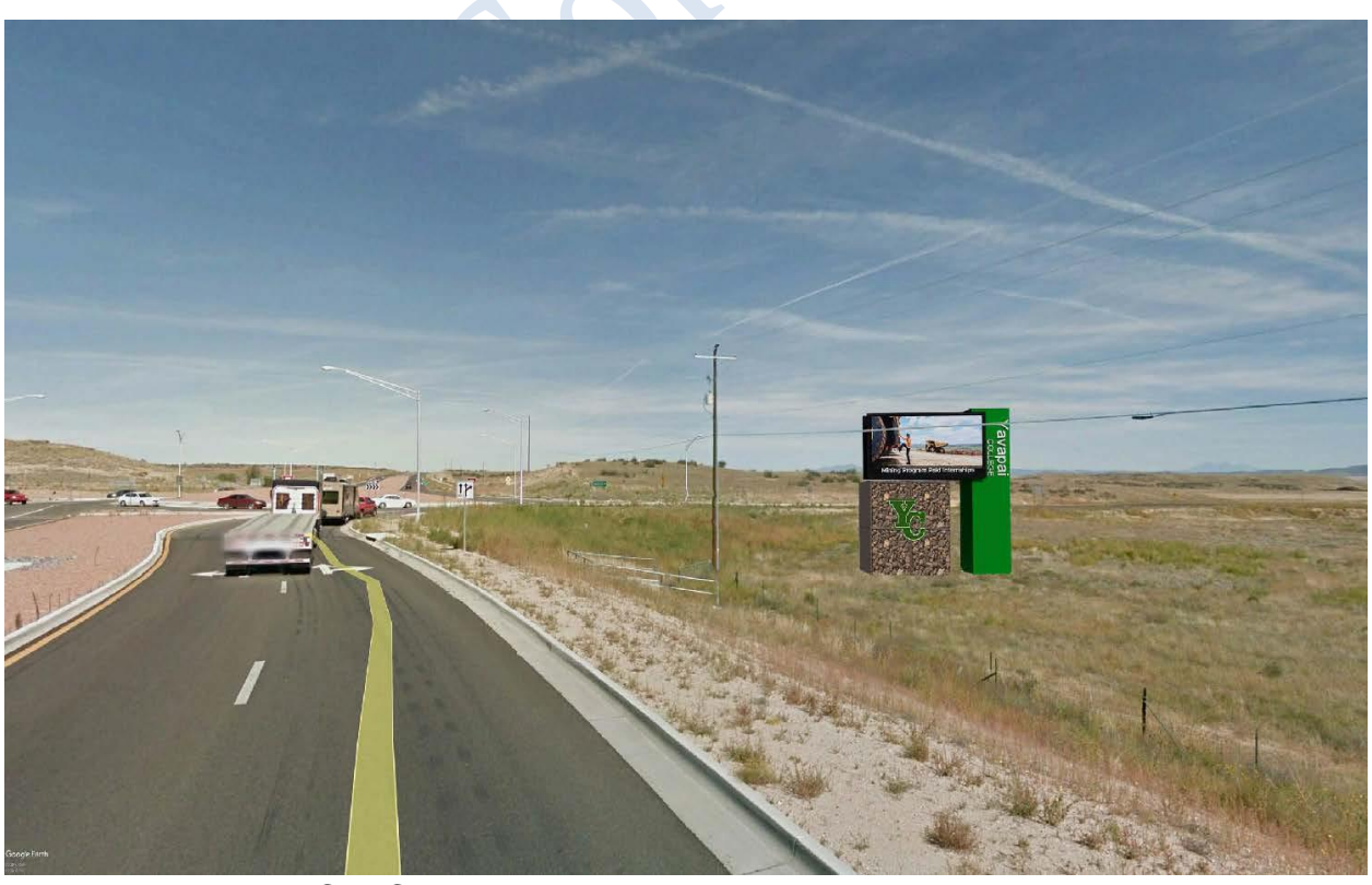
CTEC Highway 89 Possible Location Rendering