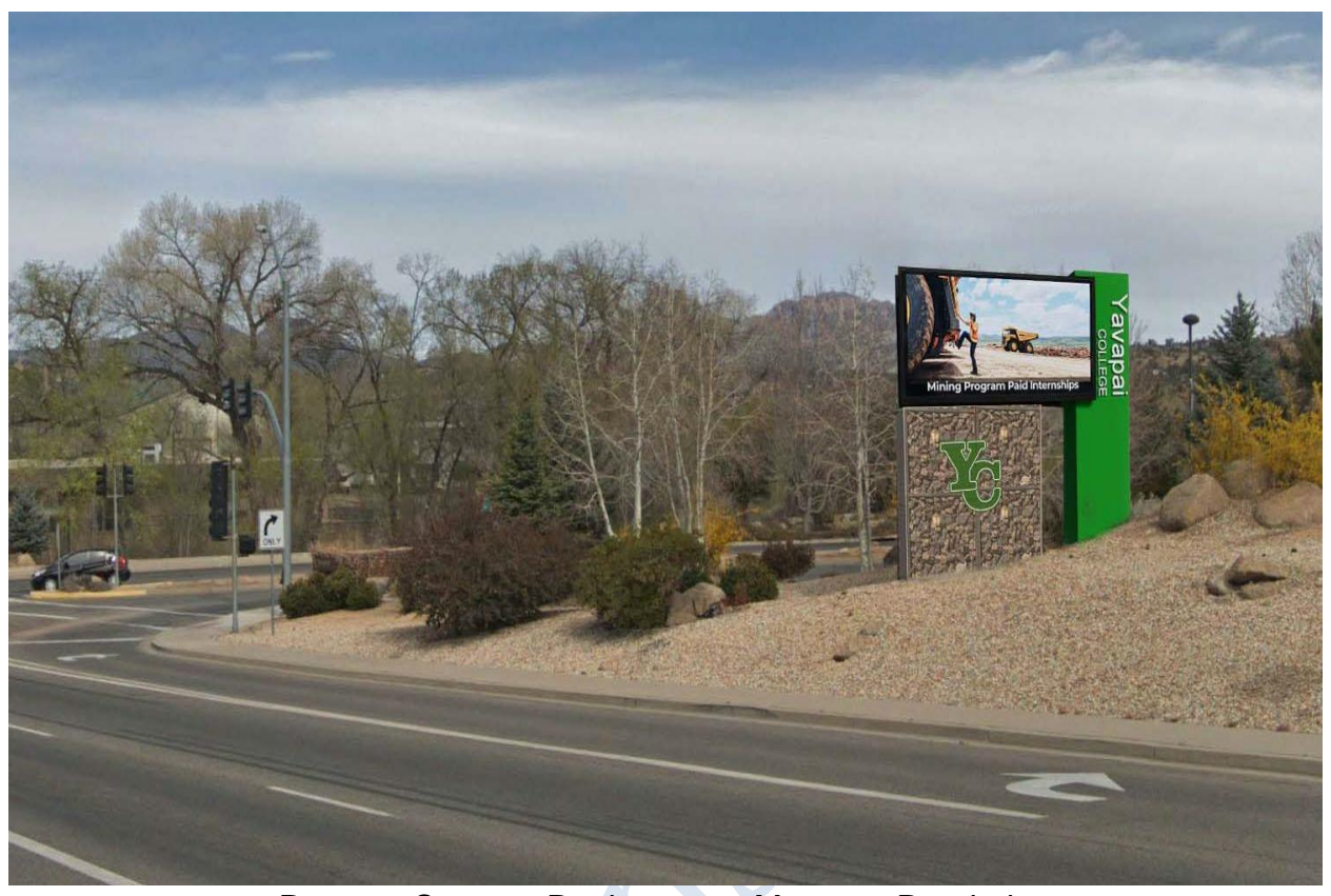
Prescott Campus Replacement Marquee Rendering