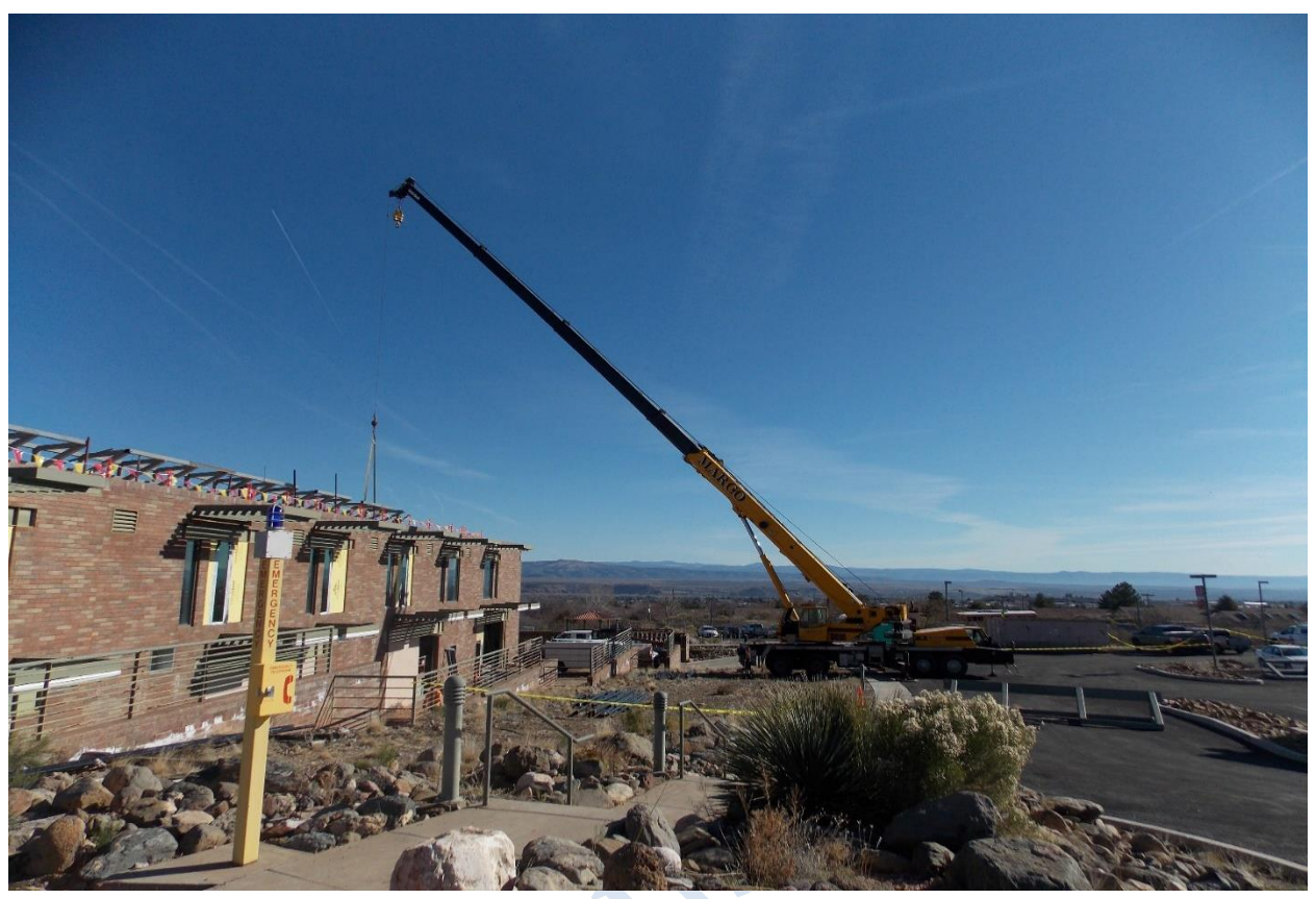
Setting Structural Steel for New Roof