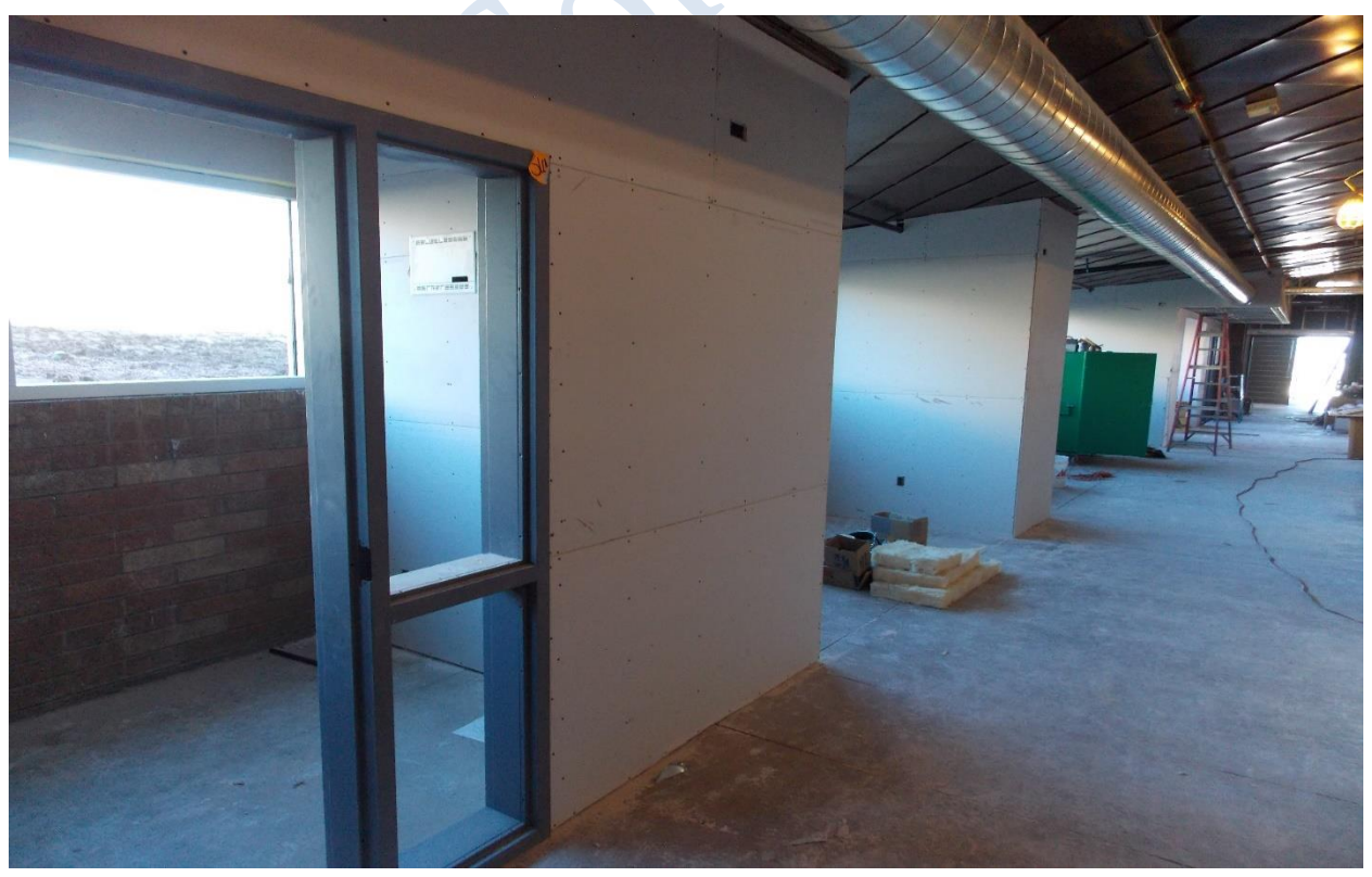
First Floor Student Study Rooms