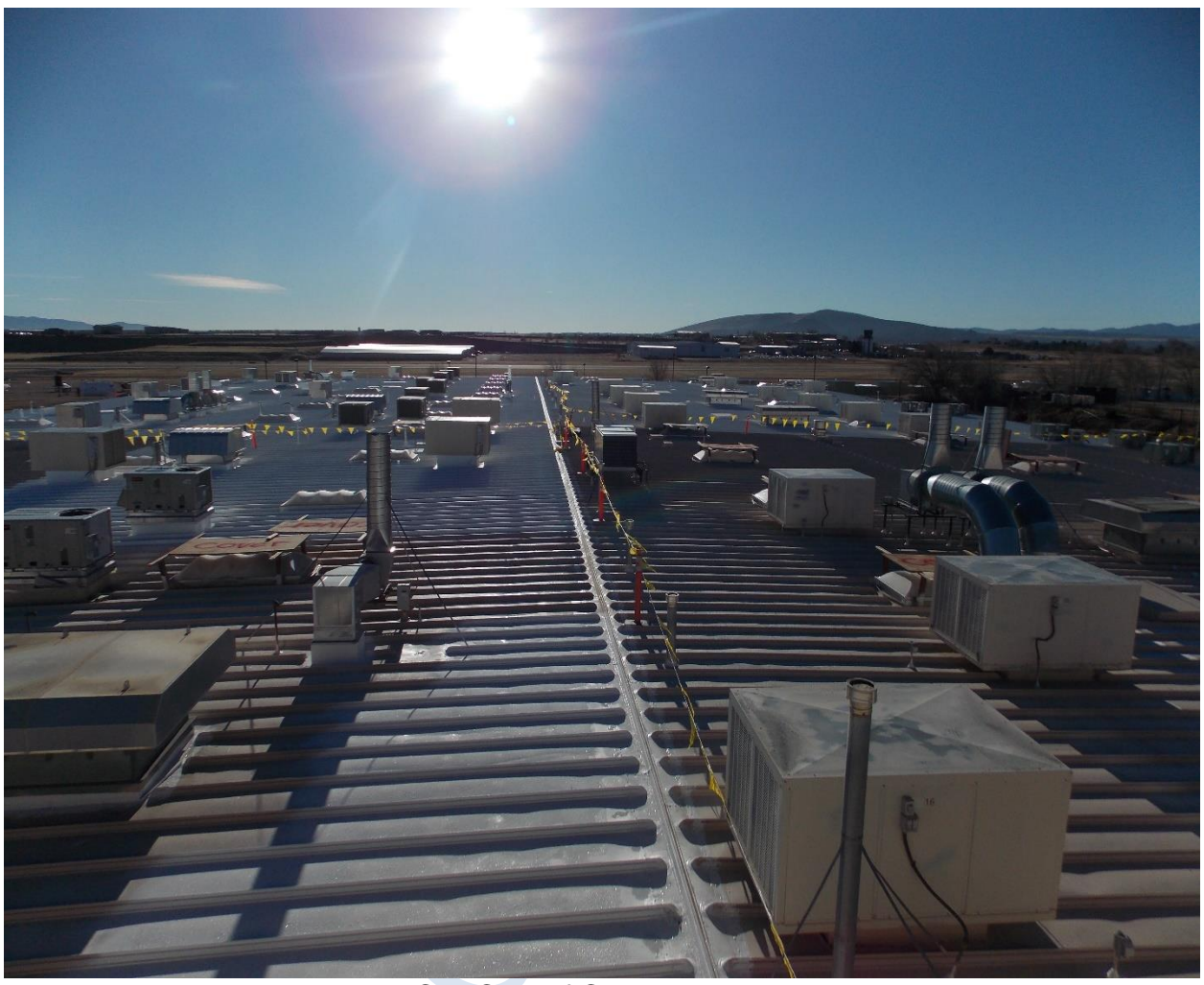
CTEC Roof Coating Project