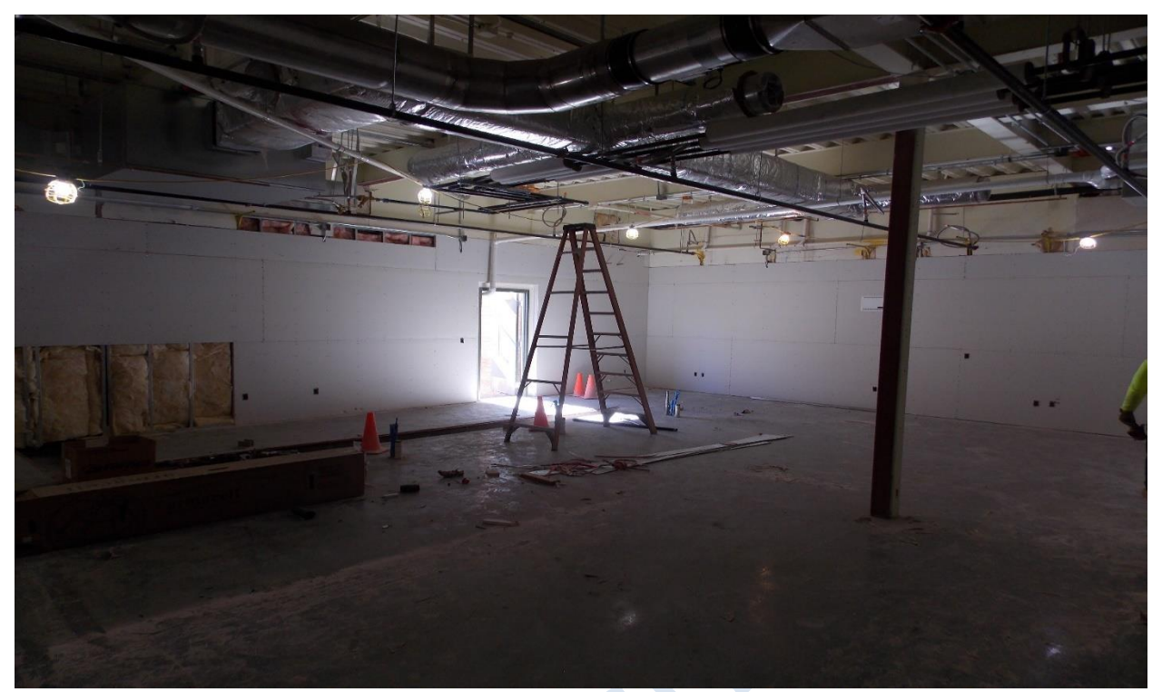
Installing Drywall at Science Lab