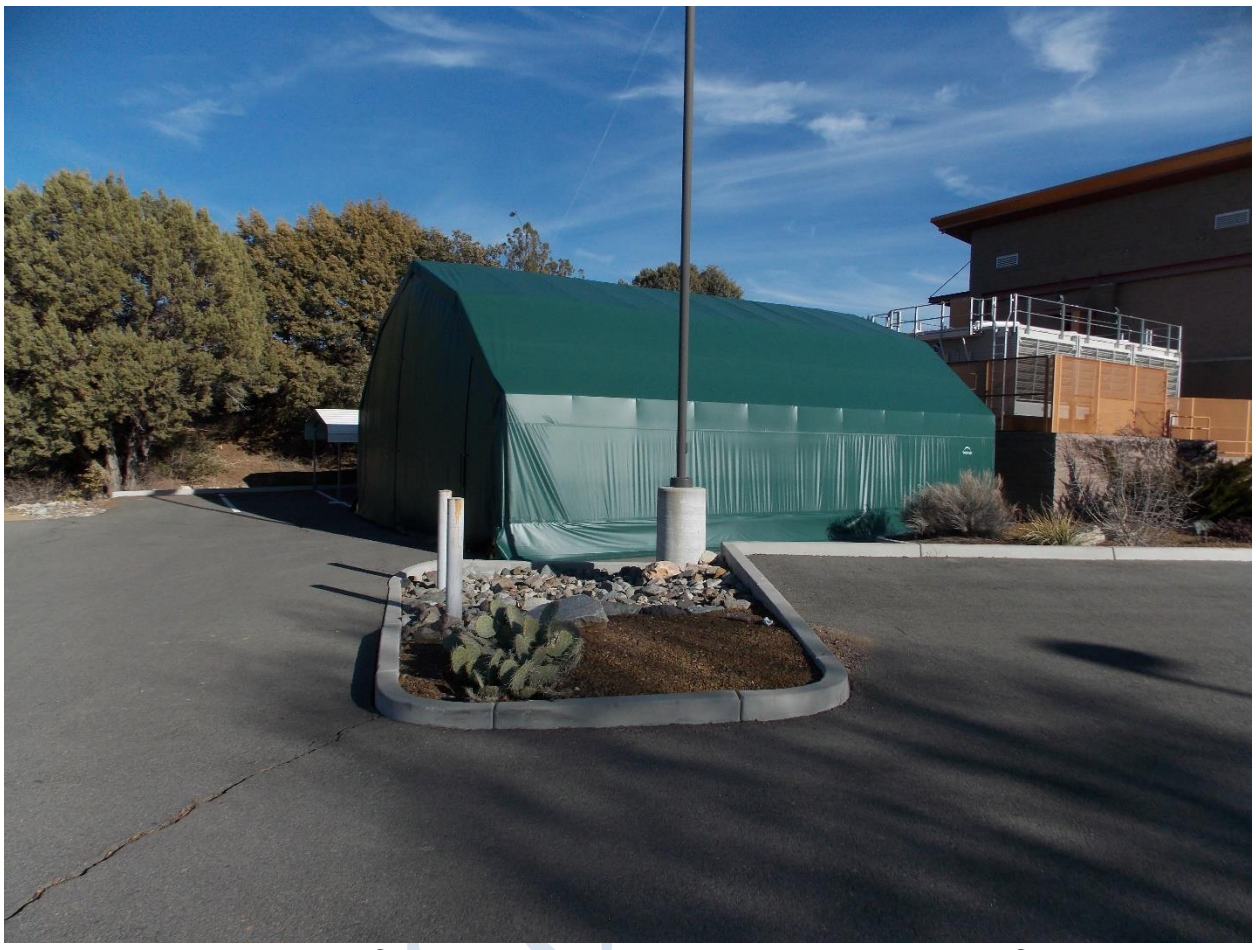
A Week Later - Complete with Interior Lighting and Electrical Service