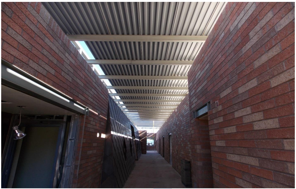
Roof Decking Enclosing Second Floor