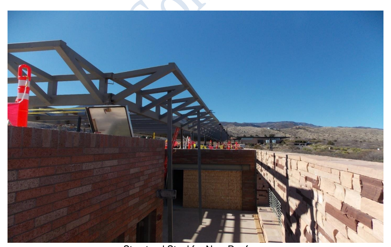
Structural Steel for New Roof