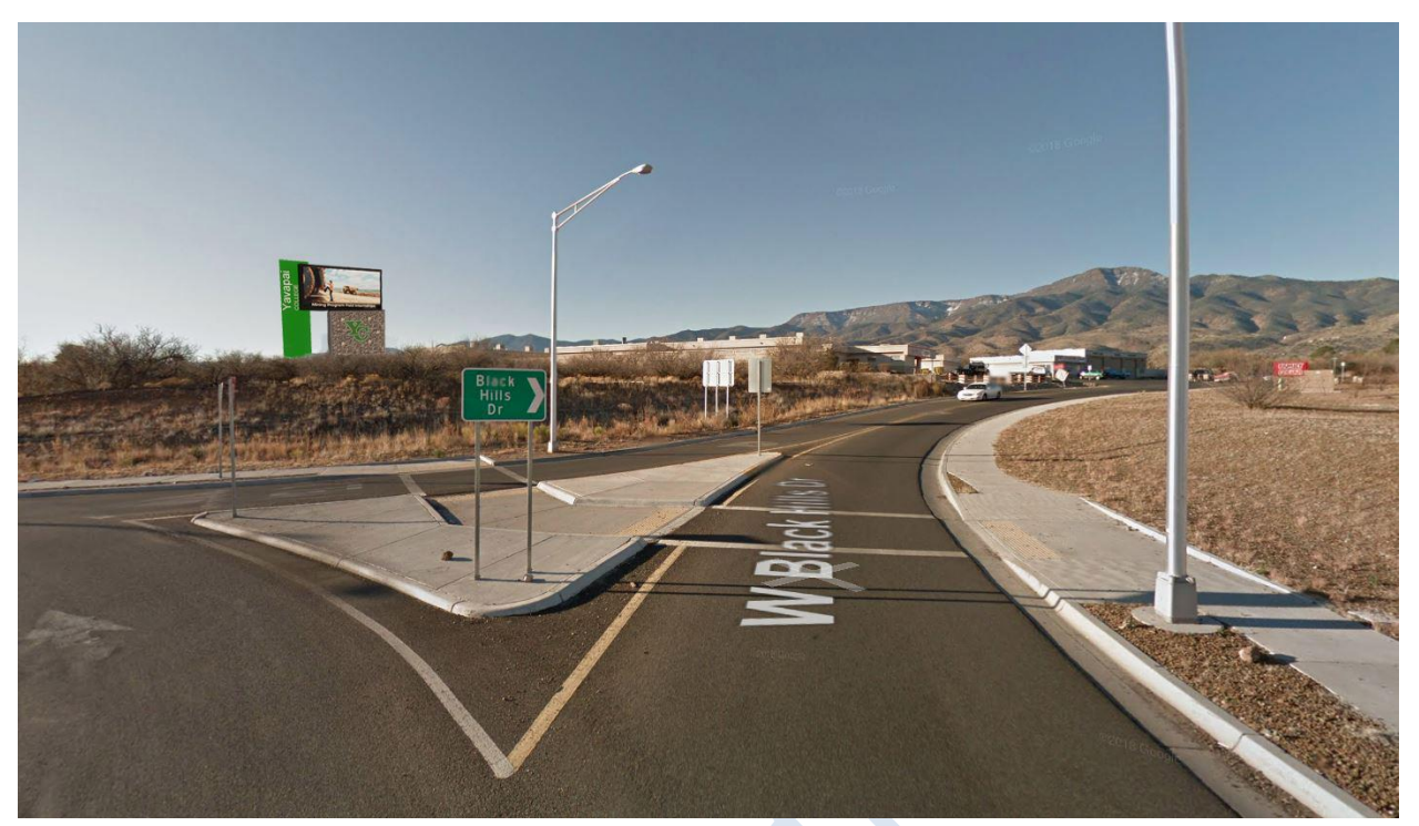
Verde Valley Campus Possible Location Rendering

If you would like more information about the campus master plan or implementation schedule, please go to <a href="http://masterplan.yc.edu/">http://masterplan.yc.edu/</a>. This site is updated regularly as new information concerning project progress becomes available.