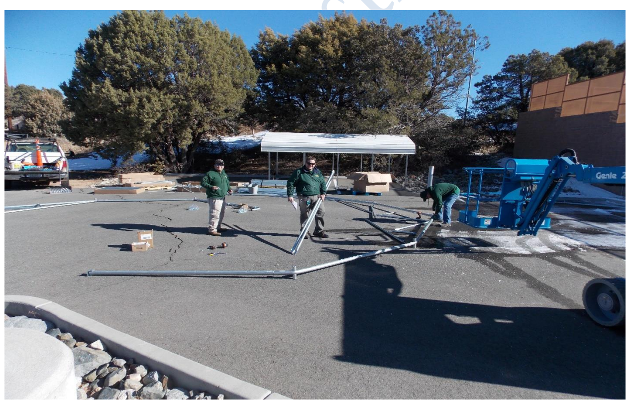
Facilities Team Members Jaime Hernandez, Brandon Biro, and Scott Ellis Begin the Assembly of the Temporary Structure for PAC Set Building

During January, a temporary structure was installed near the Art Ranch to house Set Building, while design begins for the construction of a new facility adjacent to the PAC stage. The plan is to eventually complete a small renovation to house a Technical Theater program to support visual arts activities at the PAC.