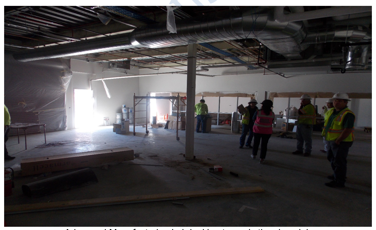
Advanced Manufacturing Lab looking towards the clean lab