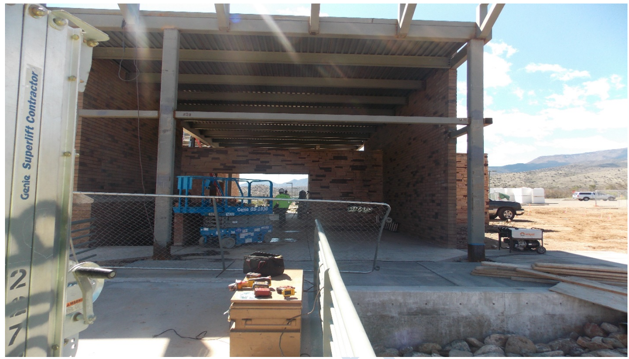
Building M side of the new front entrance