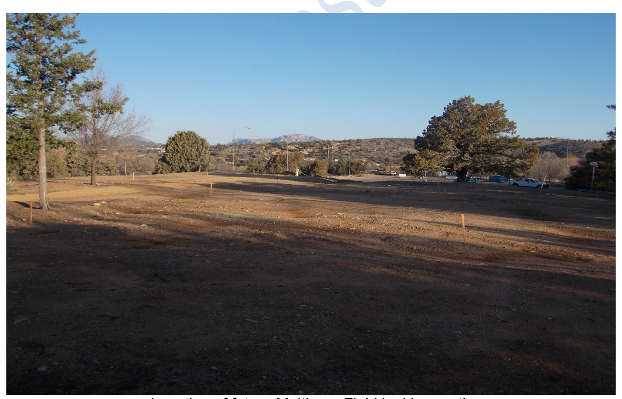
Location of future Multi-use Field looking north