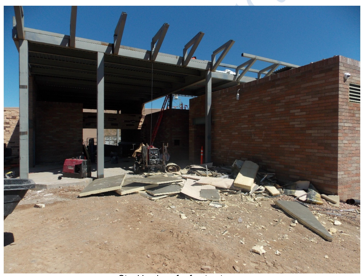
Steel in place for front entrance

Design Team: SPS+ Architects Construction Team: Kinney Construction Services