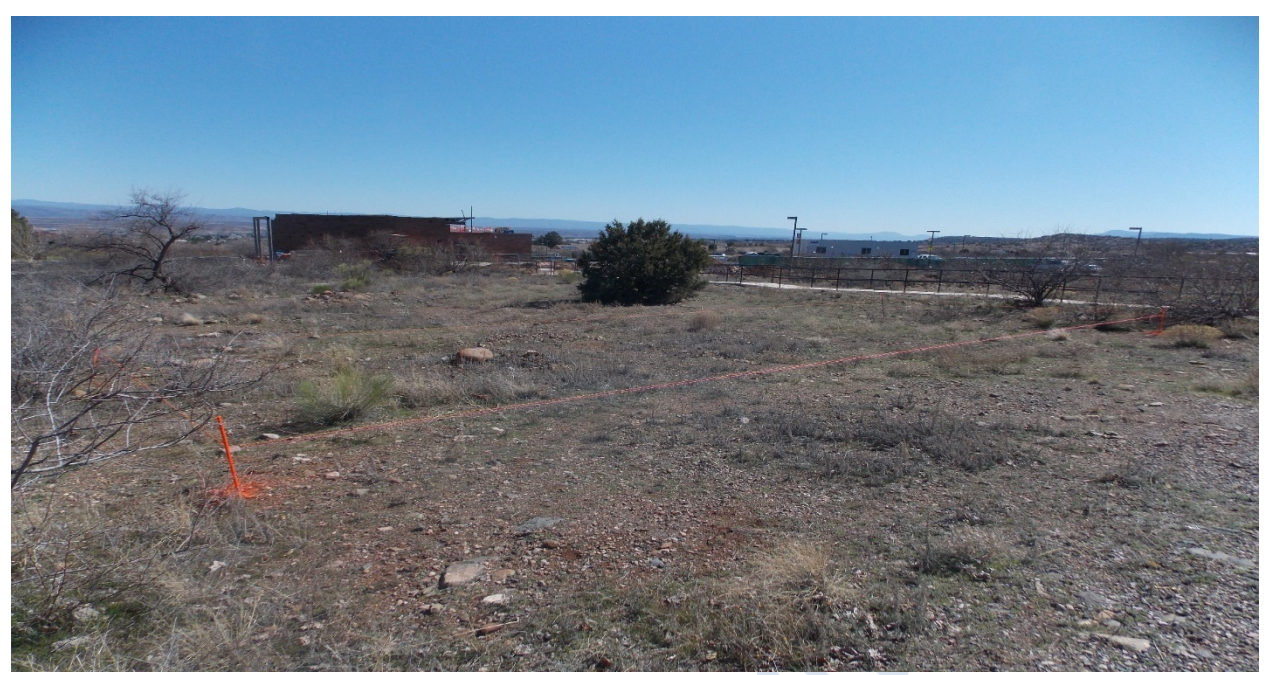
Potential greenhouse location between Buildings L and O (Southwest Wine Center)