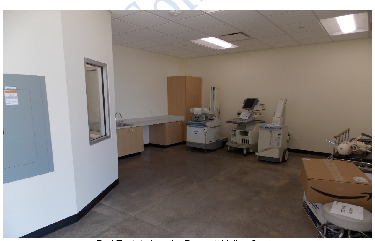
Rad Tech Lab at the Prescott Valley Center