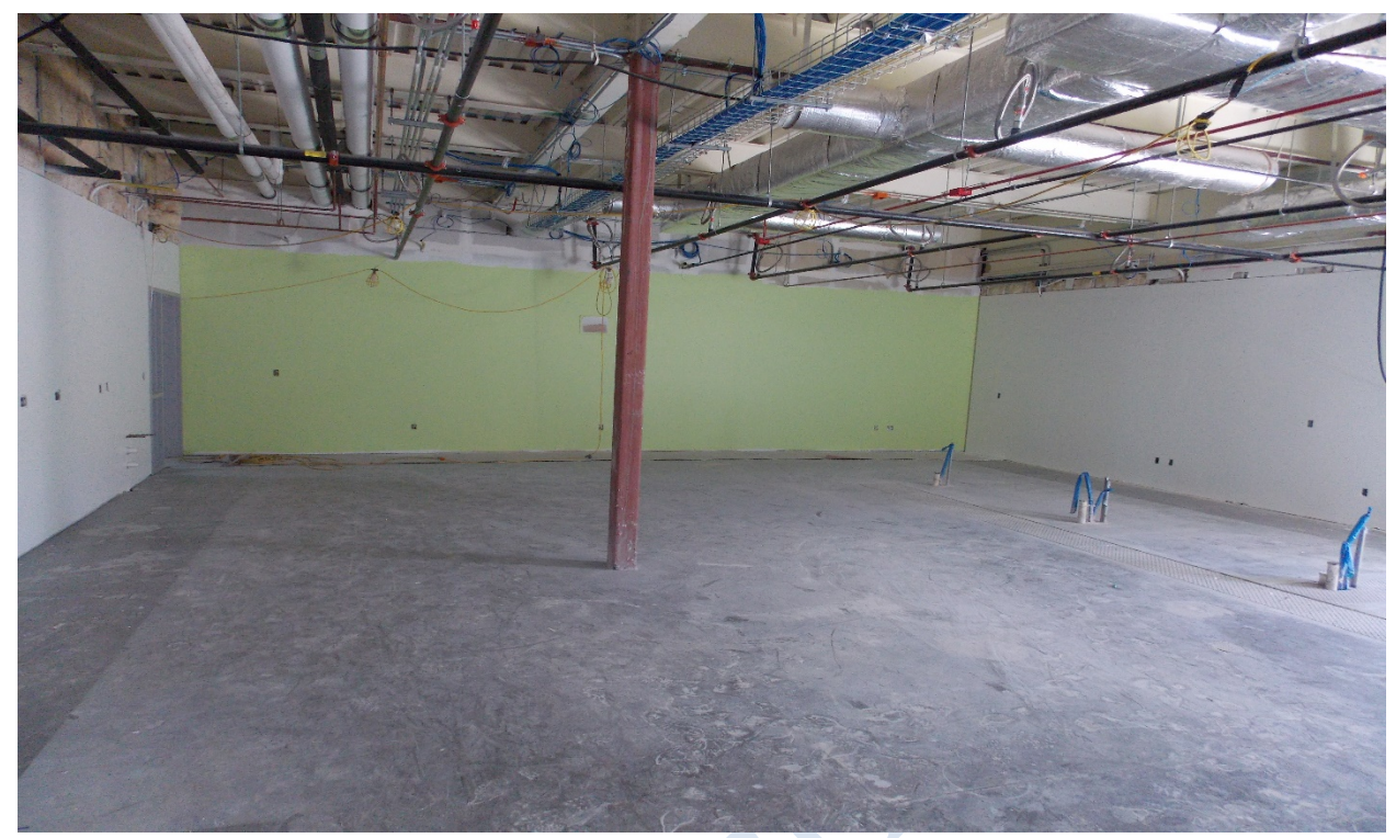
Painting begins in Biology Lab