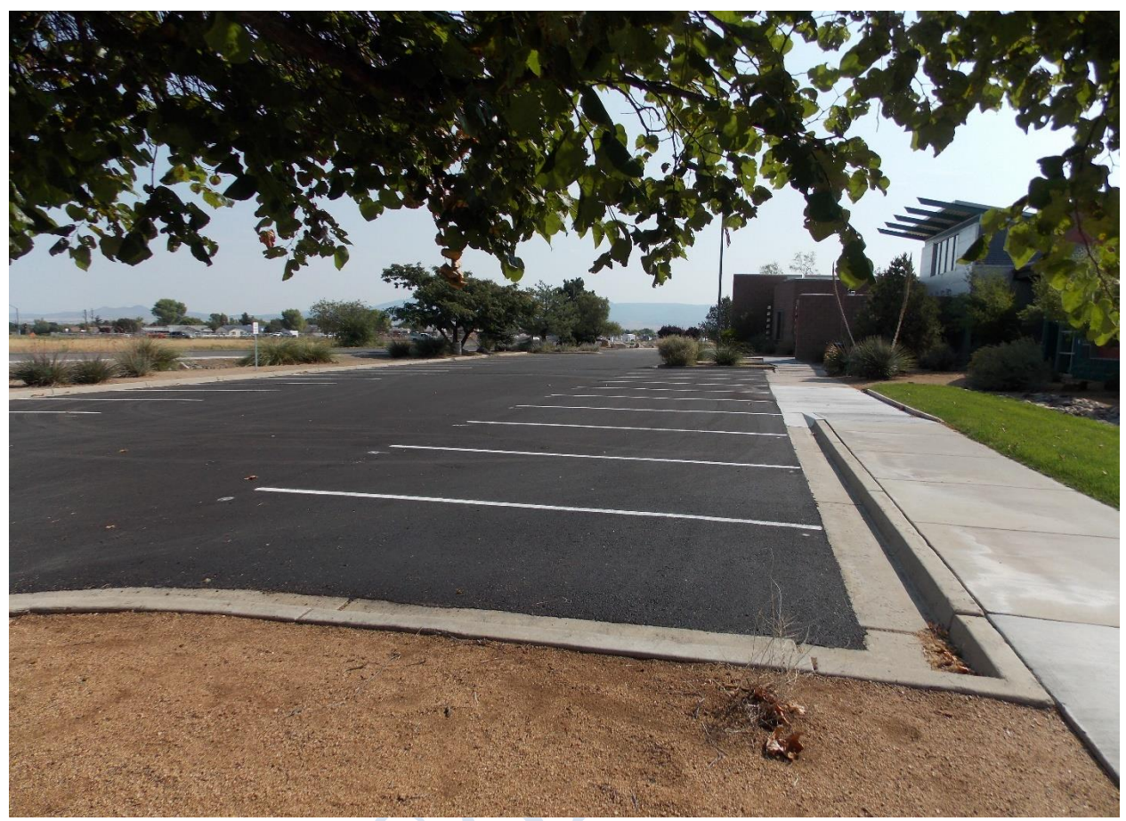
Parking lot replacement at Prescott Valley Center