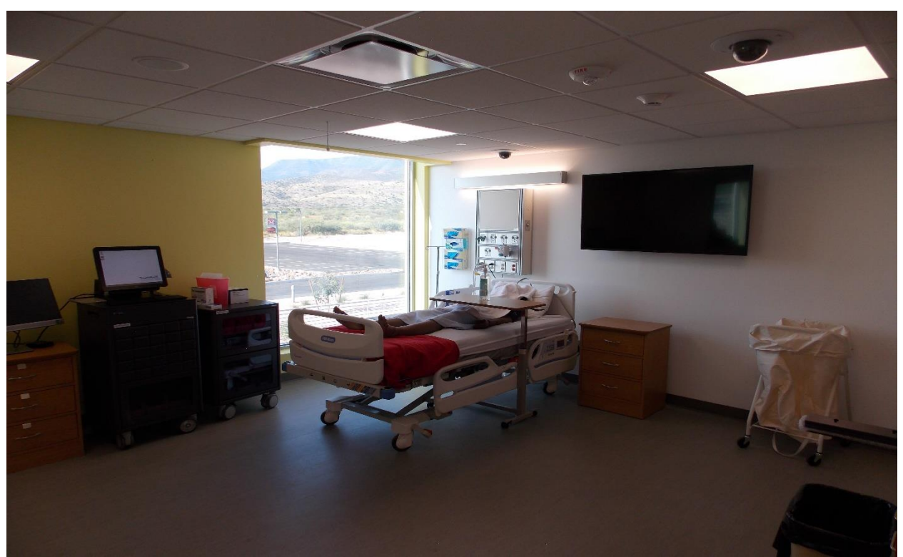
One of the simulator labs (Control and Debrief Rooms not Shown)