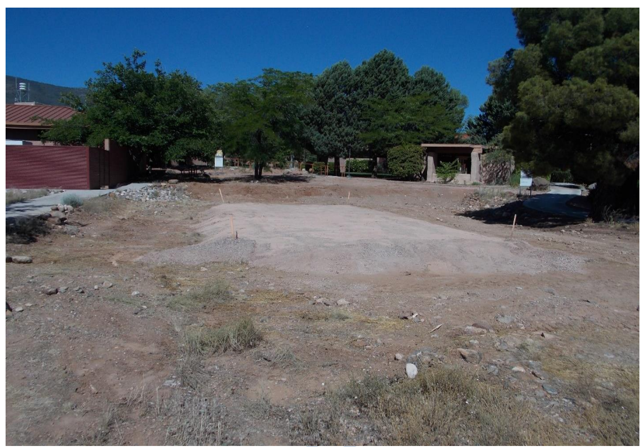
New greenhouse pad at the Verde Valley Campus