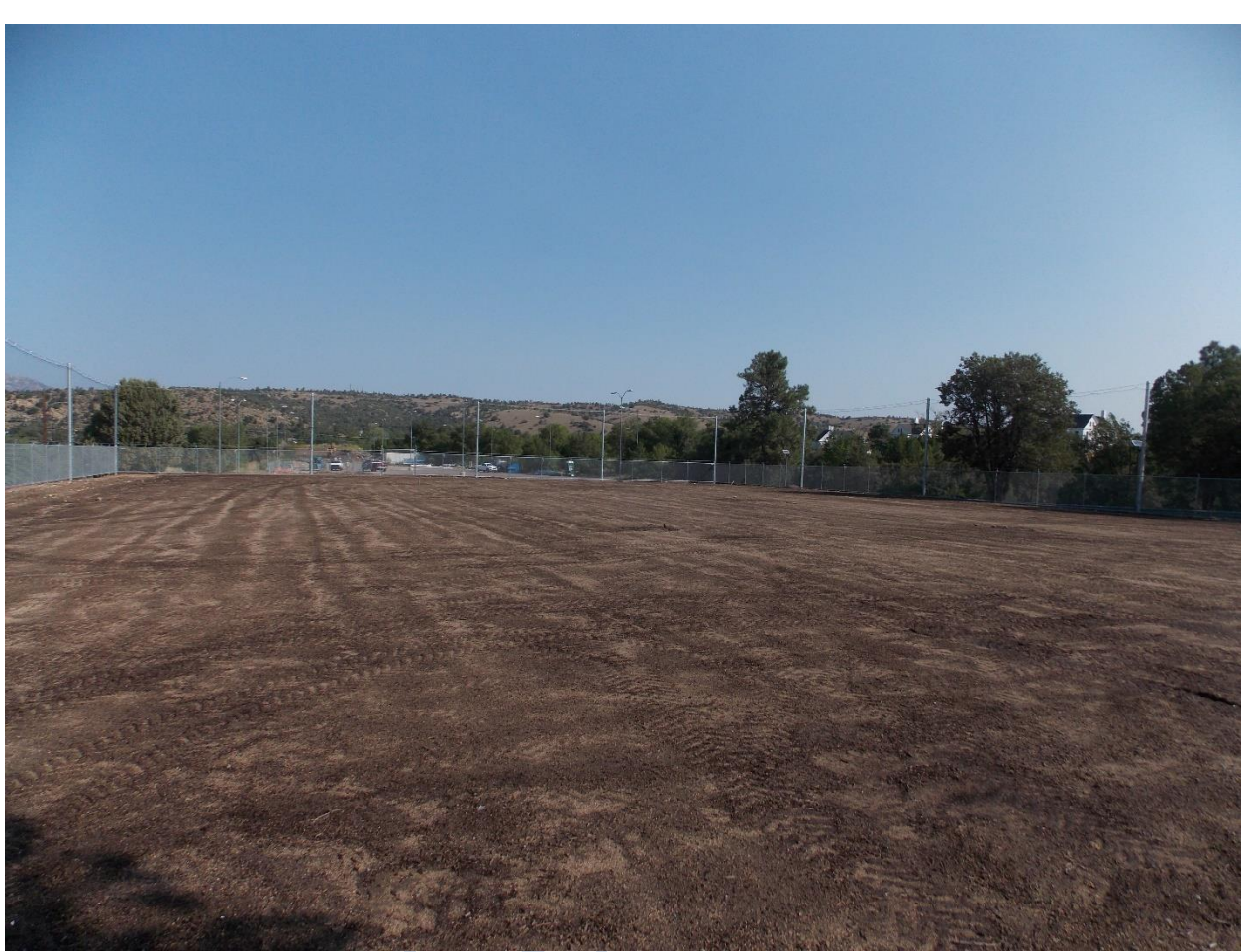
Installation of structural support for fence and netting system