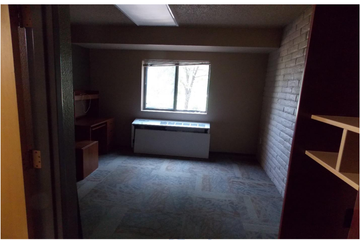
Kachina Residence Hall room after HVAC plumbing replacement