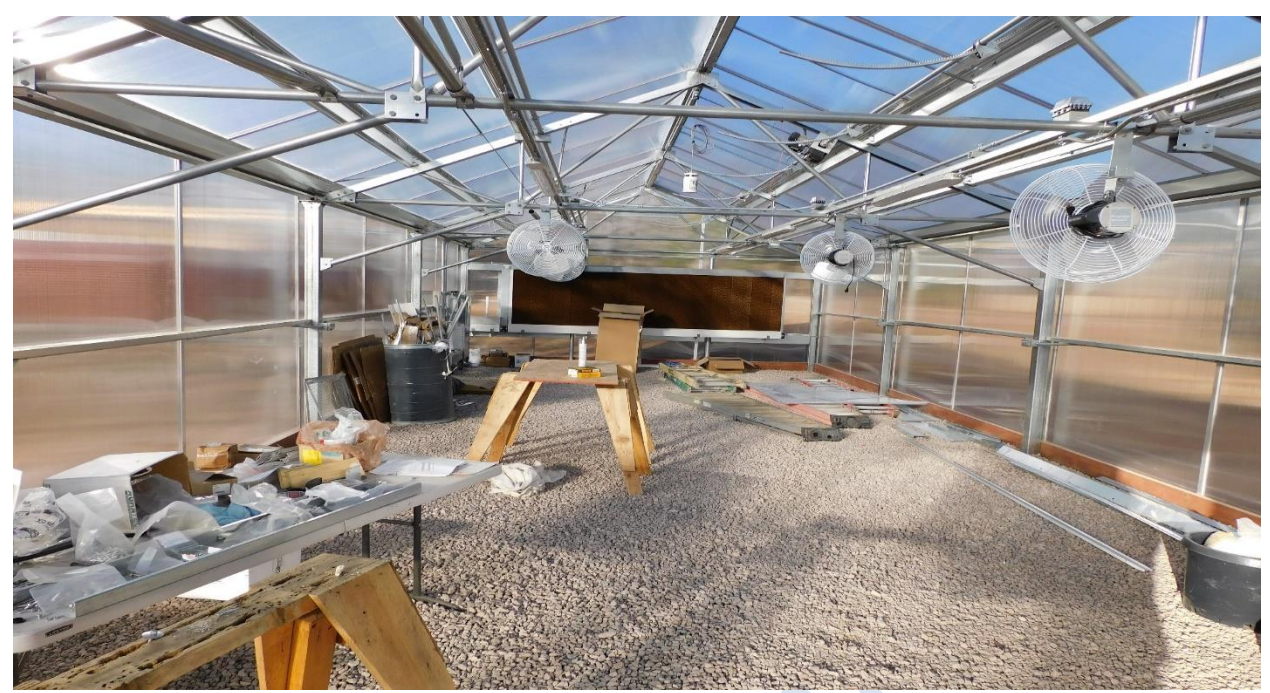
Installation of fans and other electrical items