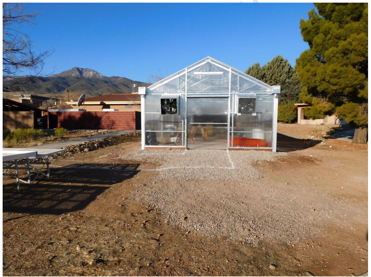
Front of the new greenhouse with proposed sidewalk location outlined