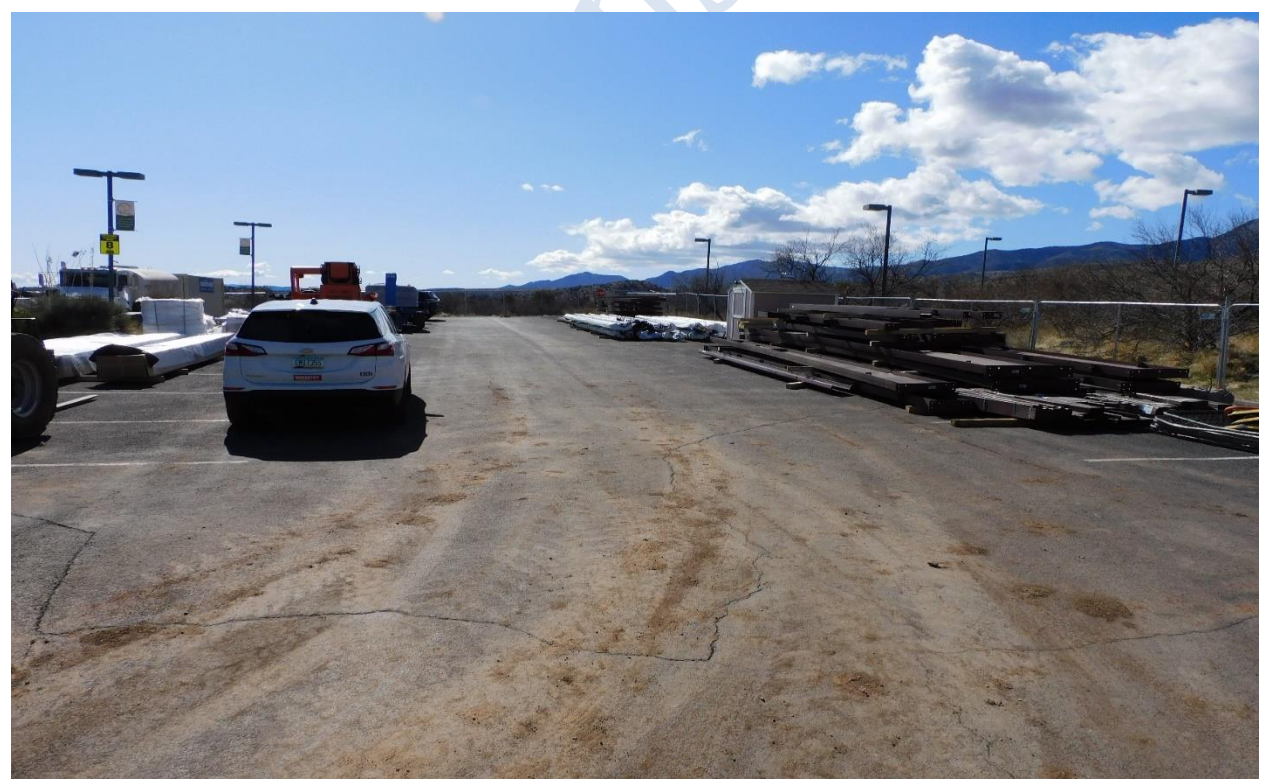
Engineered building components arrive on site