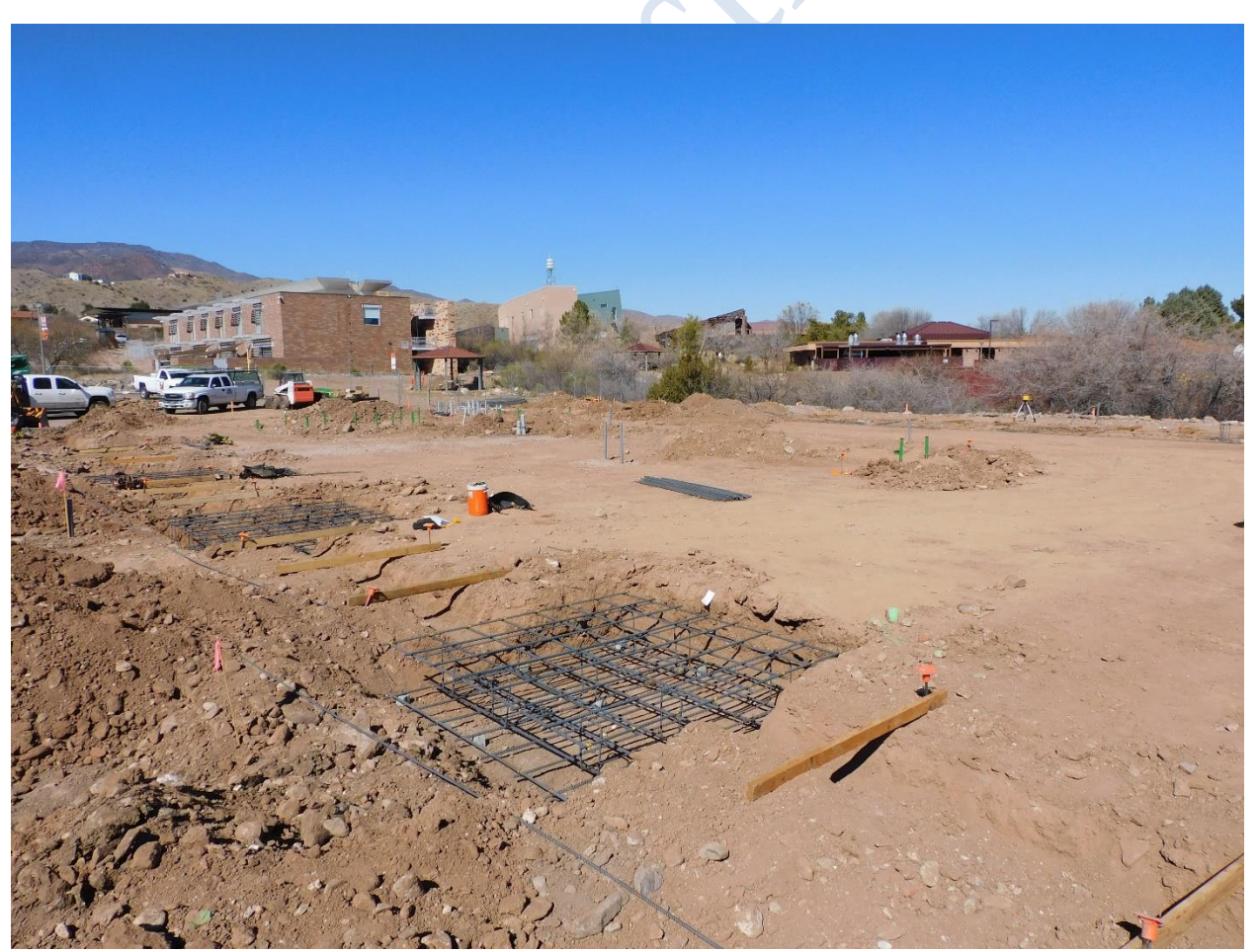
Location of new building column footings

Construction Team: McCarthy Building Systems