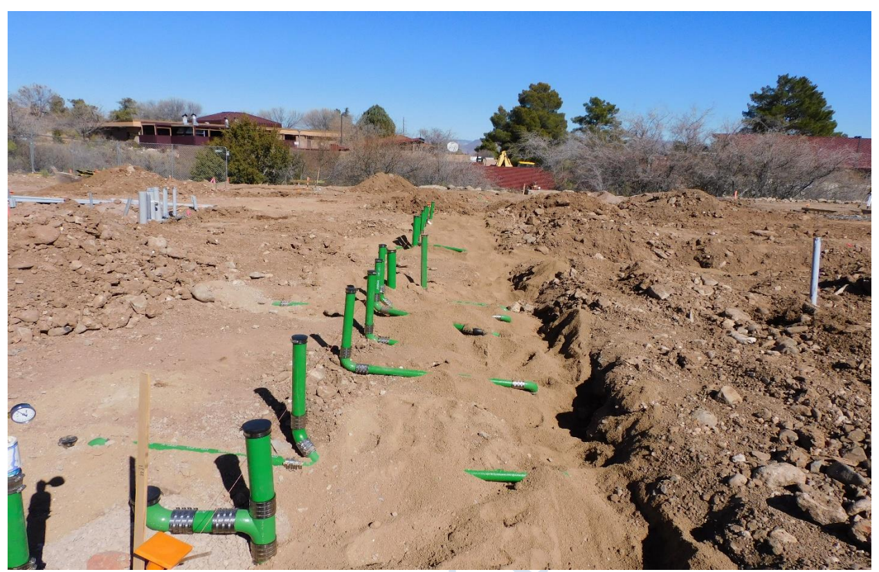
Plumbing underground stubb outs