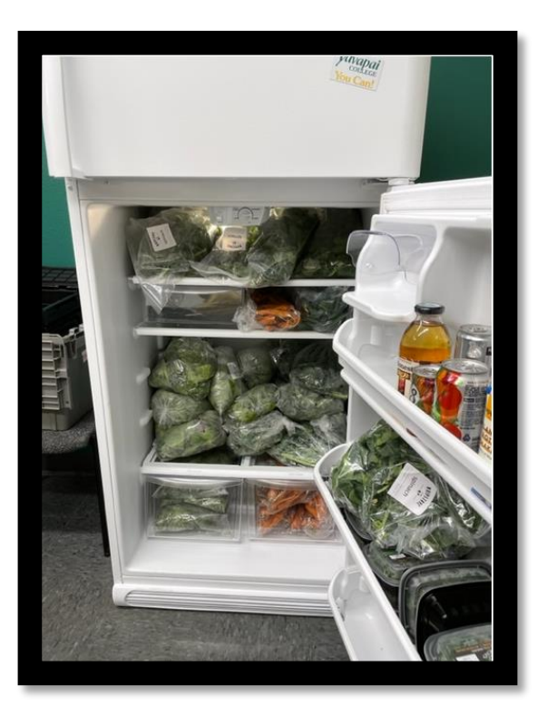
Food Pantry Refrigerator!