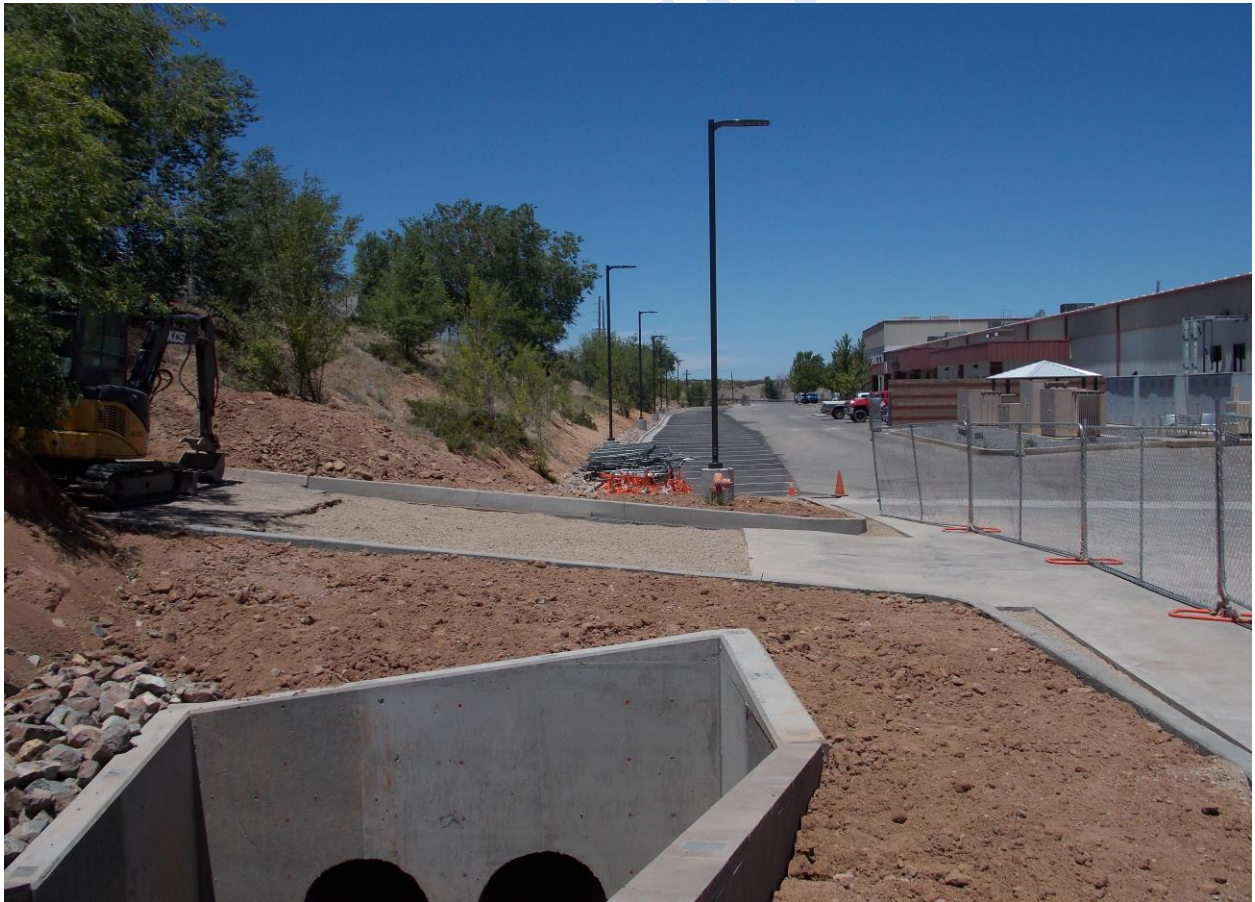
CTEC Site Drainage and Parking Lot Expansion Project