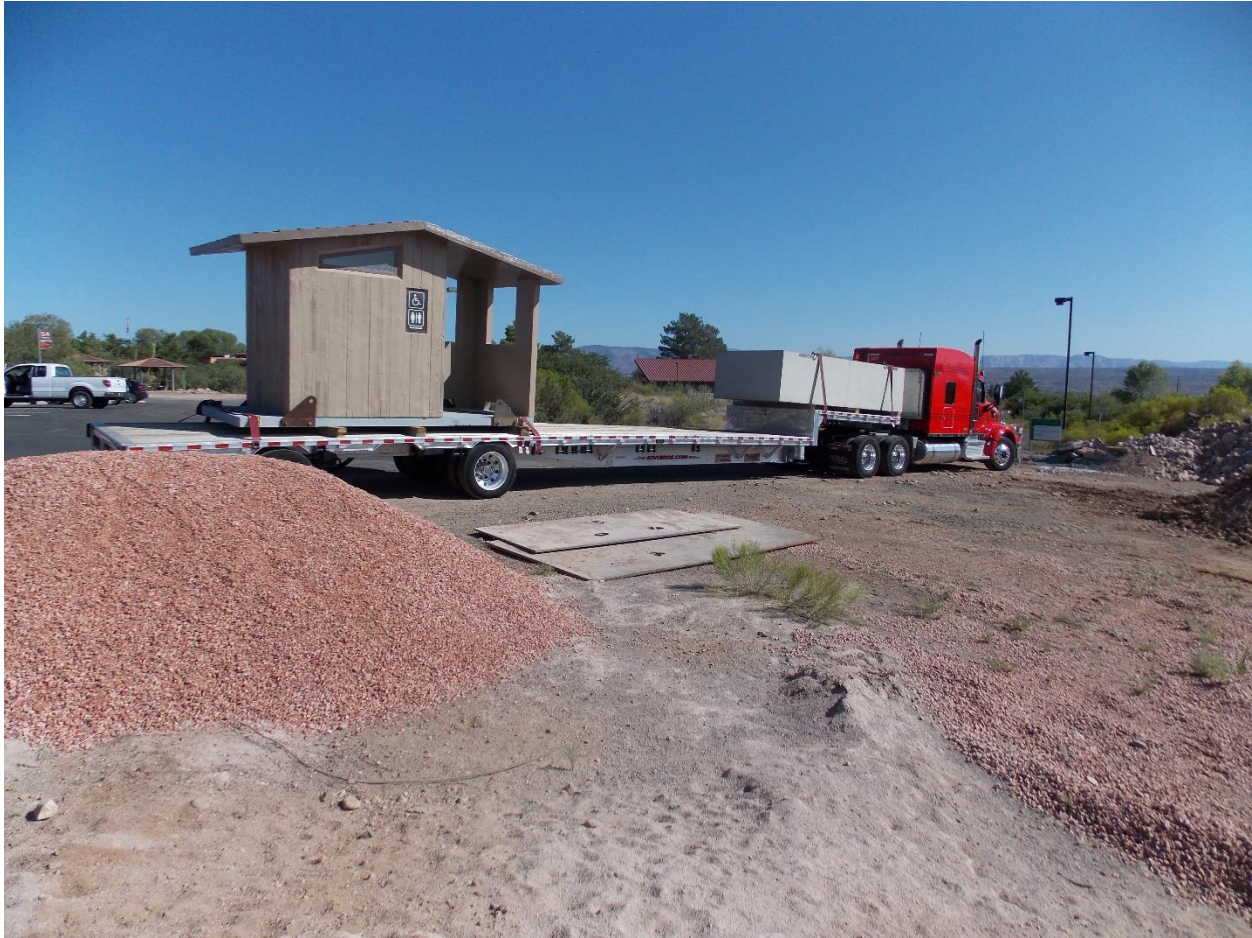
New Trail Head Restroom Being Delivered for Installation by The Grounds Team