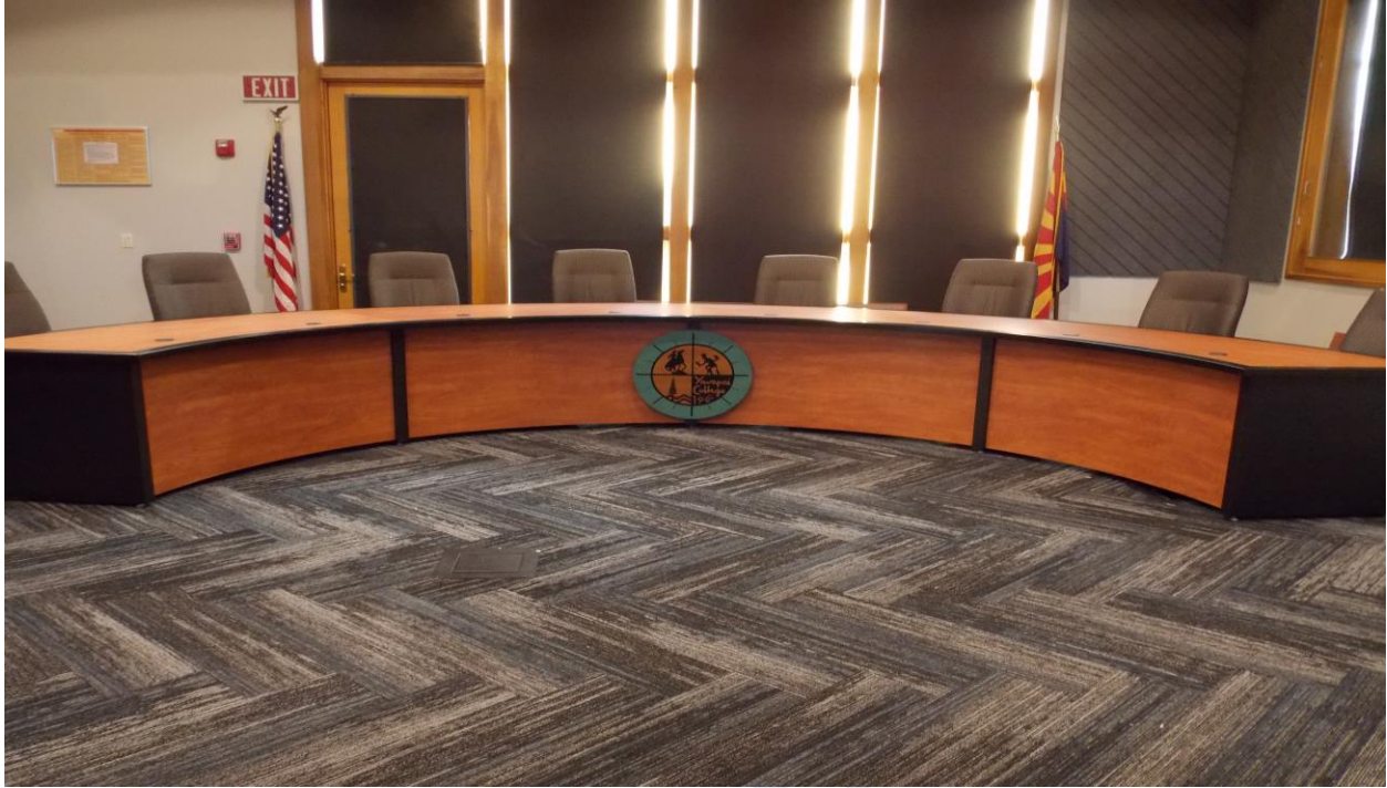
Facilities and ITS Preparing New DGB Table for Use