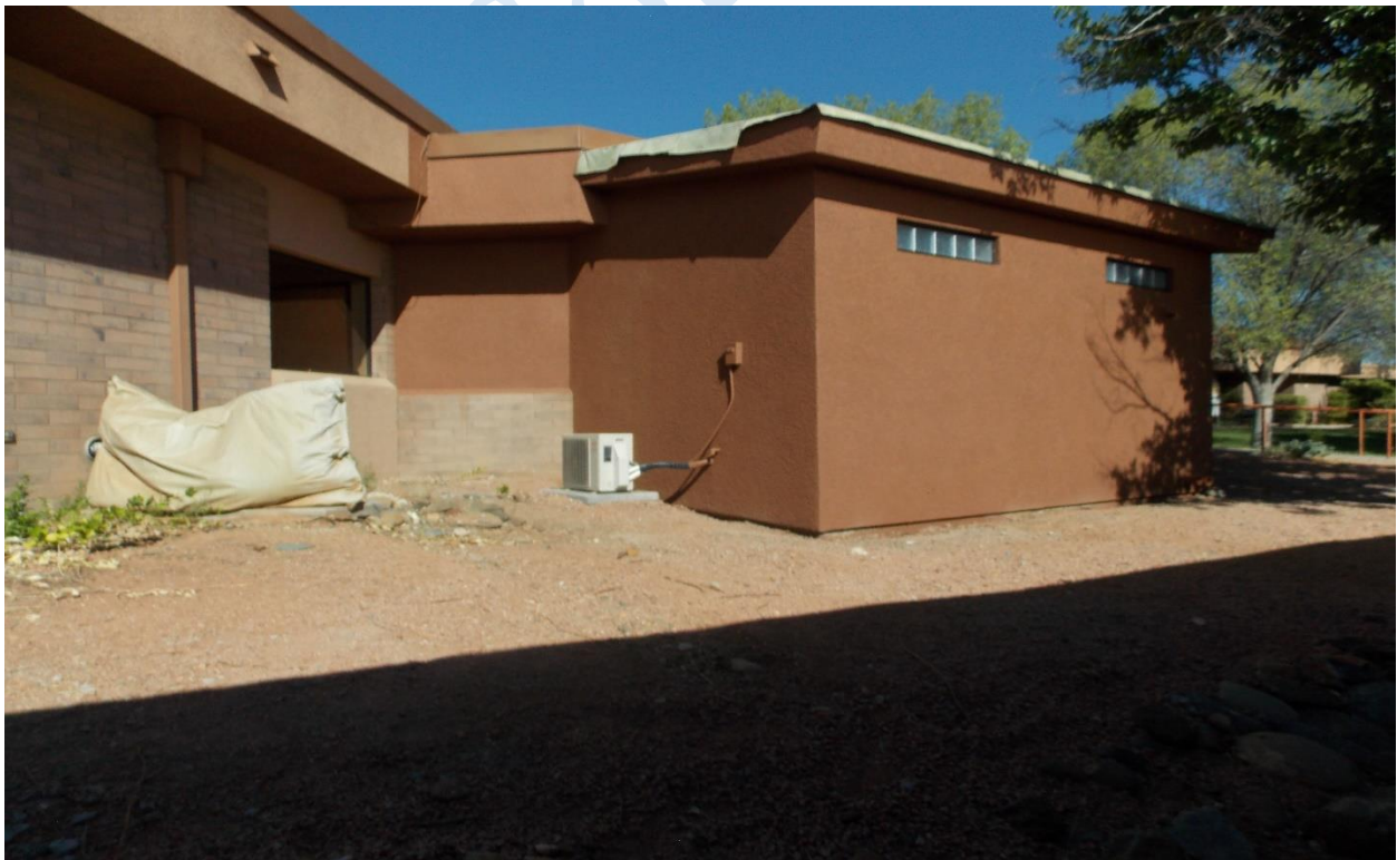
Jewelry Addition in Building H