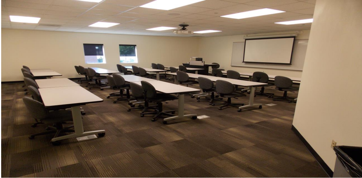
Refreshed Classroom 110