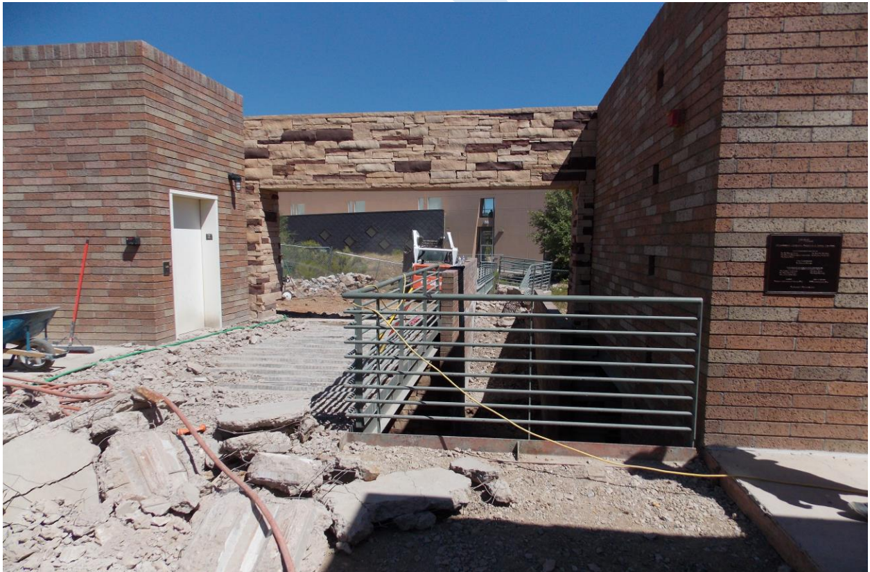
Demolition of West Stairwell and Bridge Approach to Building M