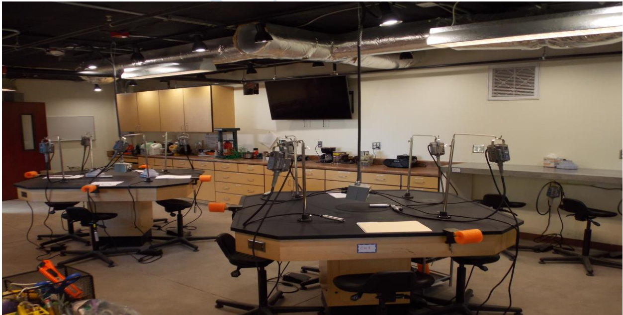
New Millwork and Counter Tops in Jewelry

Work at the Verde Valley campus related to the Building L moves is wrapping up with the completion of H-103 for Jewelry. Roof flashing will be installed the week of August 26.