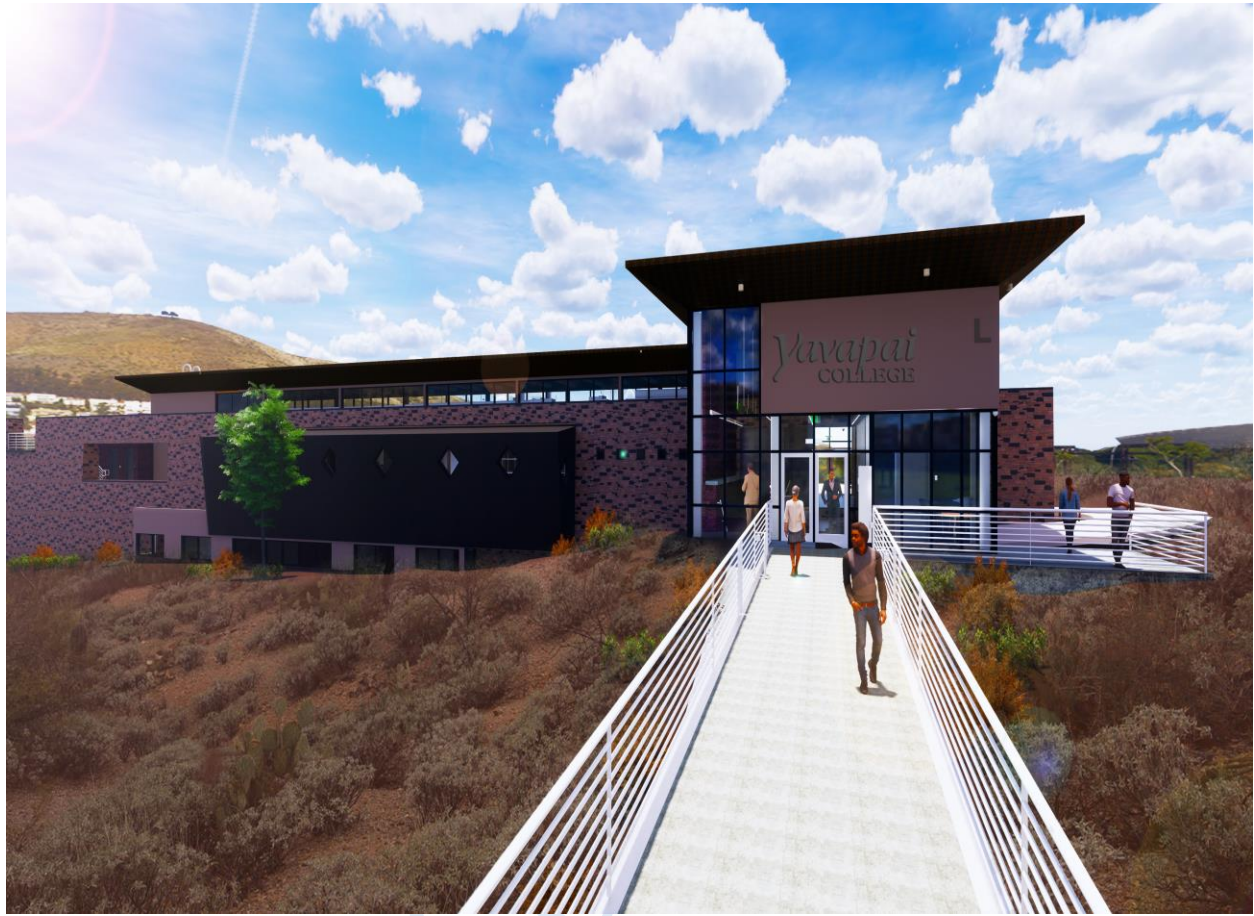
Rendering of Building L as Viewed from Building M

Please go to http://masterplan.yc.edu/ for more information about the campus master plan or implementation schedule. This site is updated regularly as new information concerning project progress becomes available.