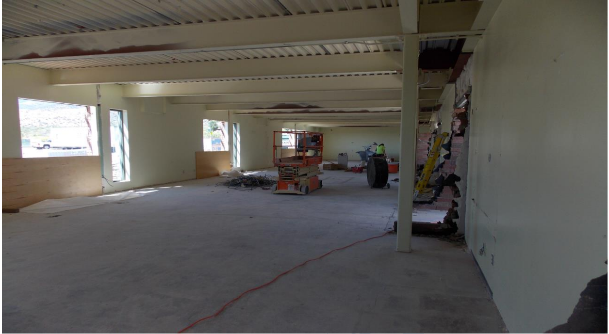
Second Floor Demolition