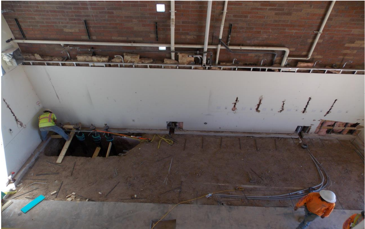
View From Second Floor Into Advanced Manufacturing