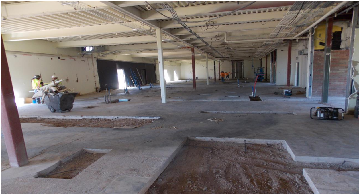
Concrete Sawing for Utilities Serving Science Labs on the First Floor

Design Team: SPS+ Architects Construction Team: Kinney Construction Services