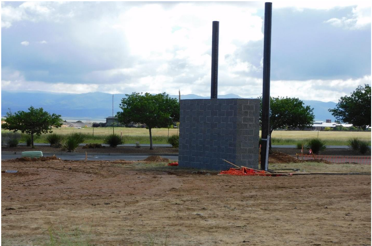
Location of electronic marquee