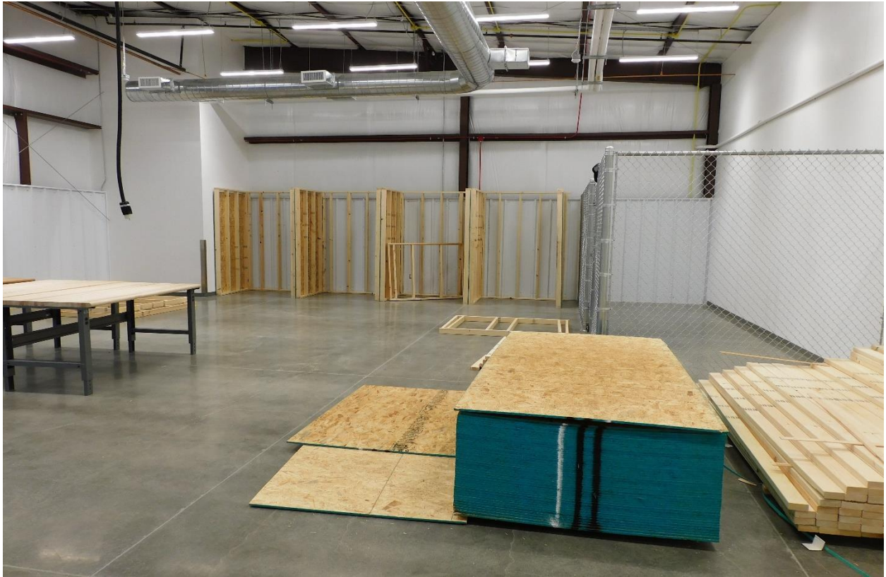
Electrical Lab – electrical mock-ups under construction