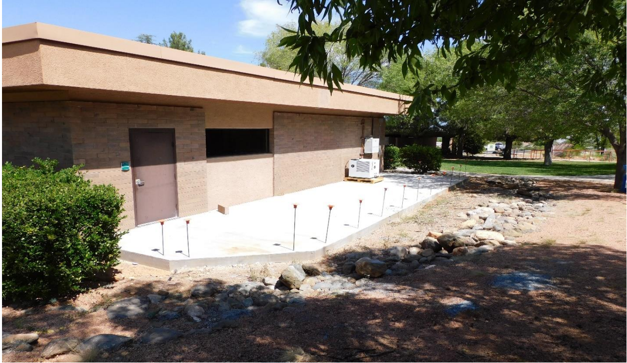
New patio and equipment pad for Brewing

The space that housed the science lab during the building L renovation is being converted into a lab for Brewing. Building G, rooms 111 and 118 will be the location of the new Brewing program.