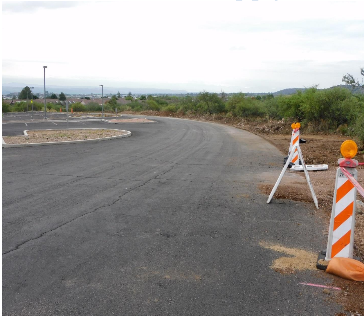
Verde Valley Campus water loop tie-in

Verde Valley Campus – Water loop tie-in – Complete