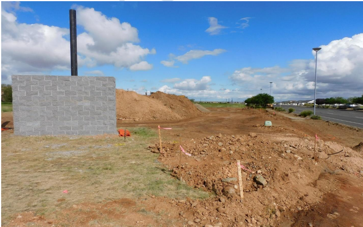
Location of upcoming deceleration lane from Glassford Hill Rd. to Prescott Valley Center

The Prescott Valley center is receiving LED parking lot lighting. Expect to see brighter lighting anticipated to generate an 80% reduction in energy consumption over the existing metal halide and high-pressure sodium lights.