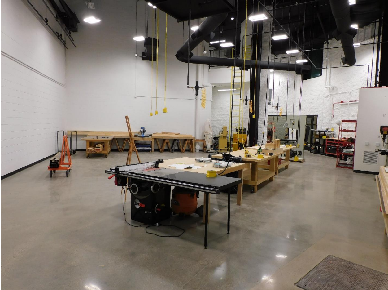
Technical Theater Lab