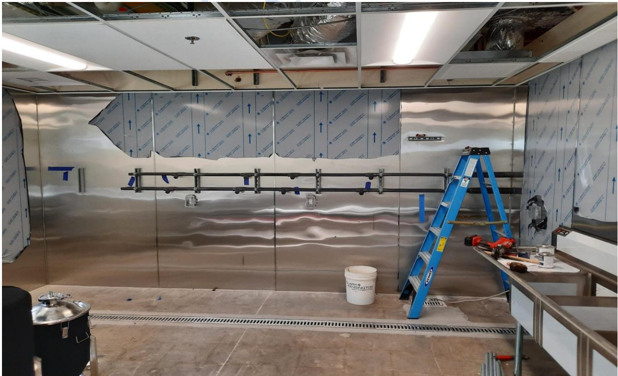
Polished floor and new stainless steel wall treatment and sinks for Brewing