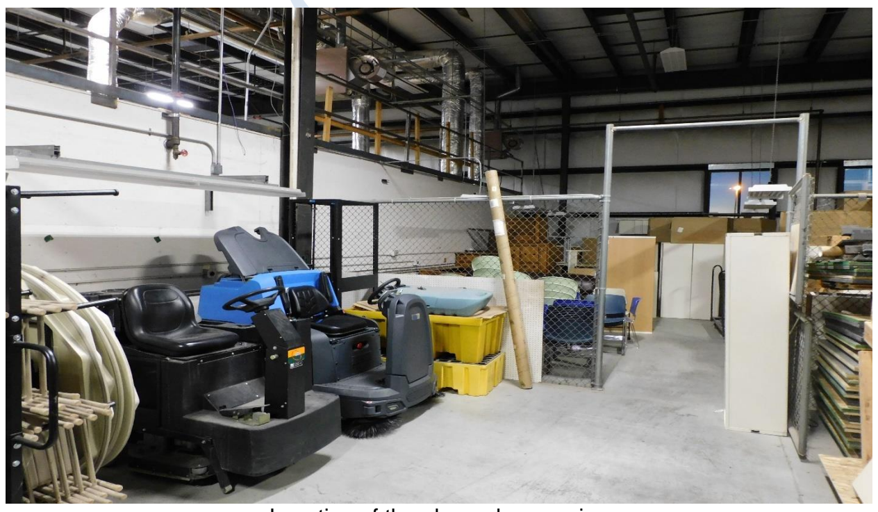
Location of the planned expansion