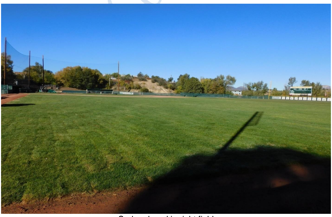
Sod replaced in right field