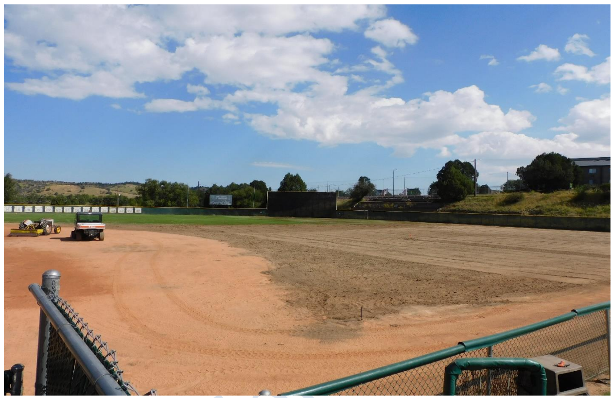
Site leveling in preparation for new sod

During September and October, grading, leveling, and sub-base preparation was underway at the baseball field to repair damage caused by flash flooding. New sod was installed in October.