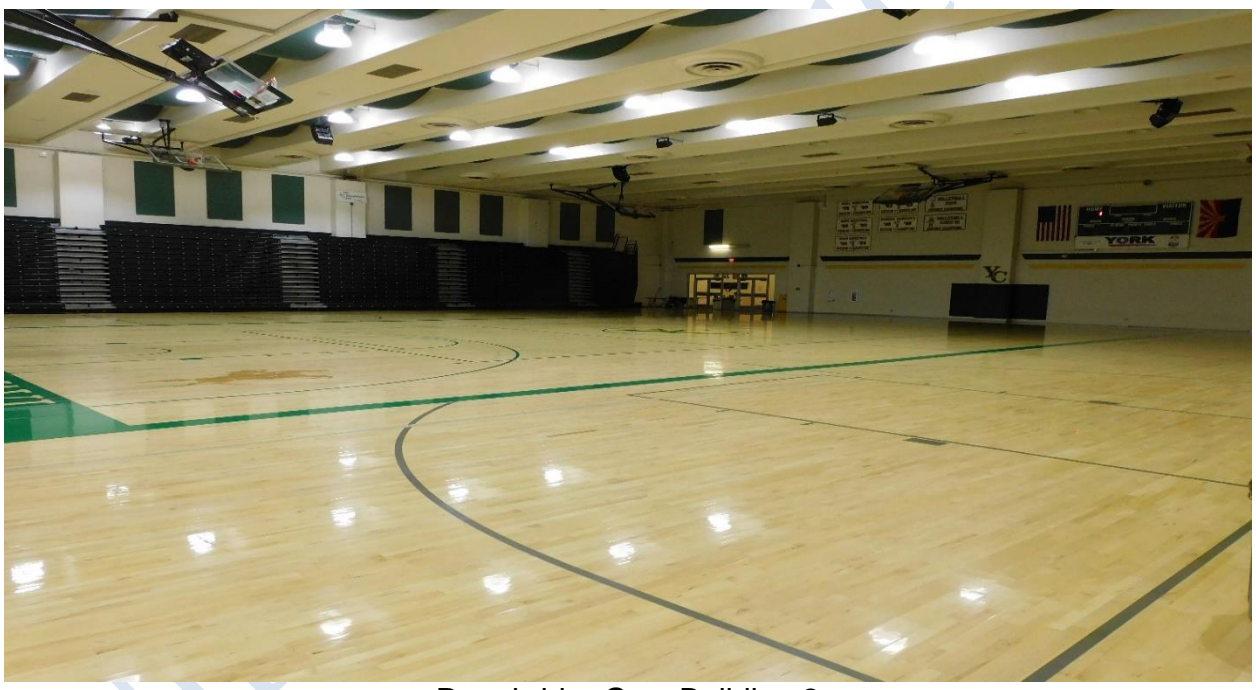
Roughrider Gym Building 2

Prescott Campus Basketball Court Resurfacing/Preparation for New Teams – December 2021 - January 2022