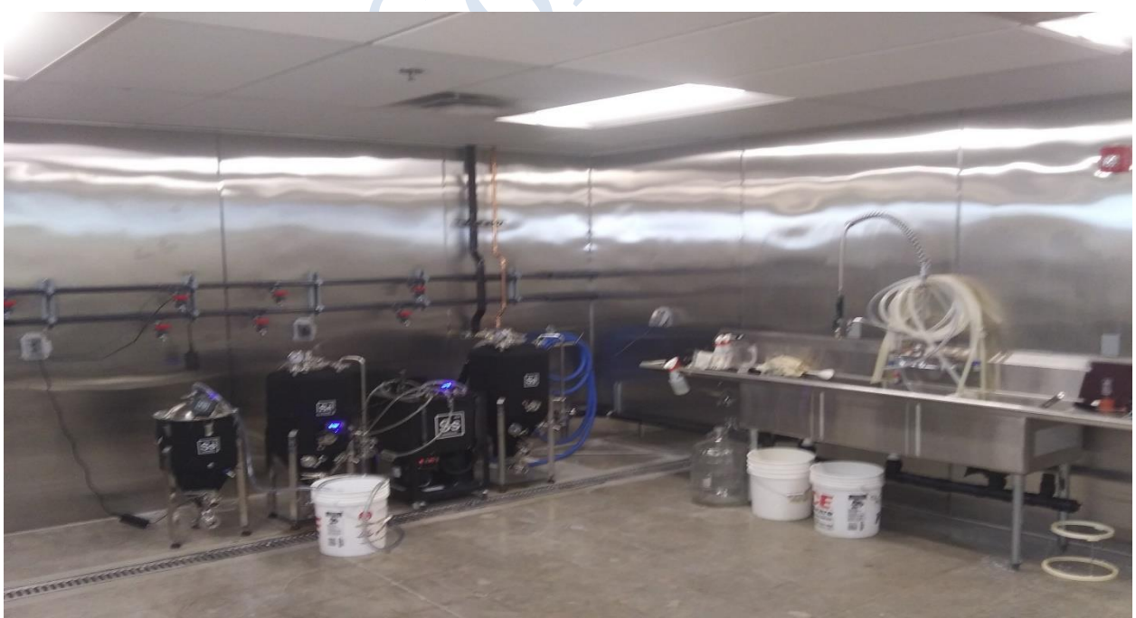
Polished floor and new stainless steel wall treatment and sinks for Brewing