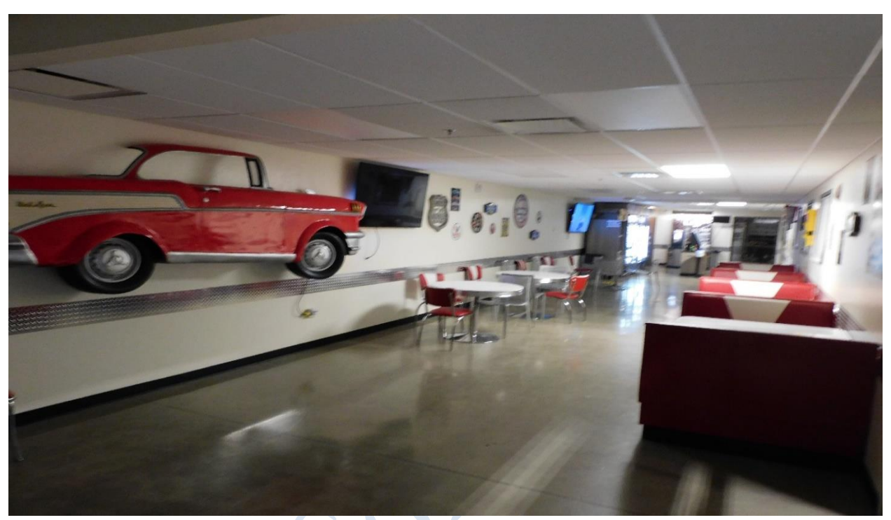
Area to be expanded

Work is projected to begin at the end of the fall semester to increase dining by expanding west creating additional seating.