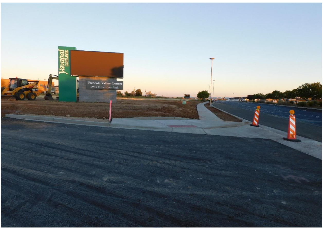
Location of deceleration lane from Glassford Hill Road to the Prescott Valley Center