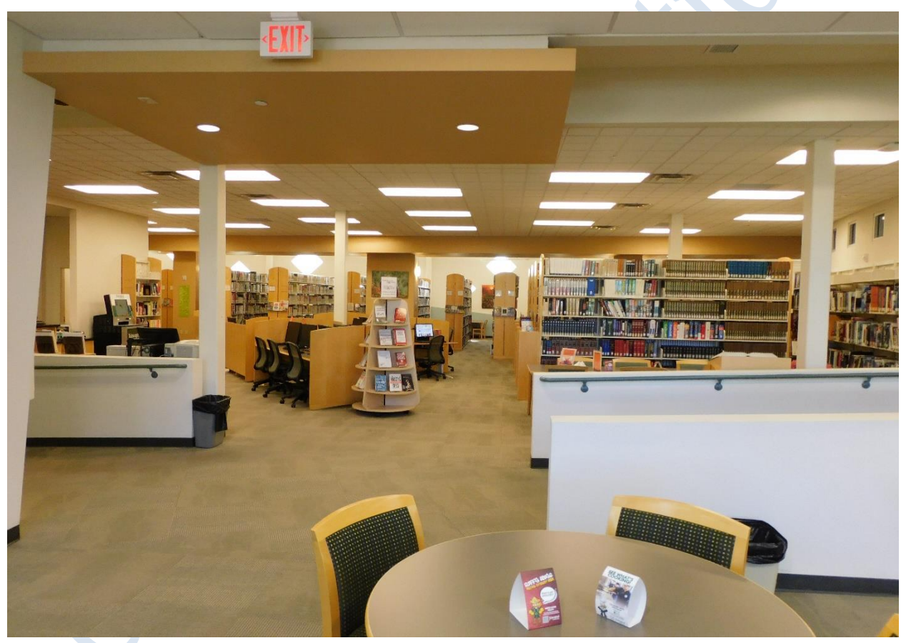
Building M Library

Verde Valley Skilled Trades Center Brewing and Distilling – postponed Digital Learning Commons Verde Valley – programming/visioning kicked off October 13 Mingus Union HS Athletic Field Improvements – in process Building 3 Rider Diner Improvements – Phase 1 Furniture install December 2022 Commercial Driving Track (Chino) – design complete/construction start November 2022.