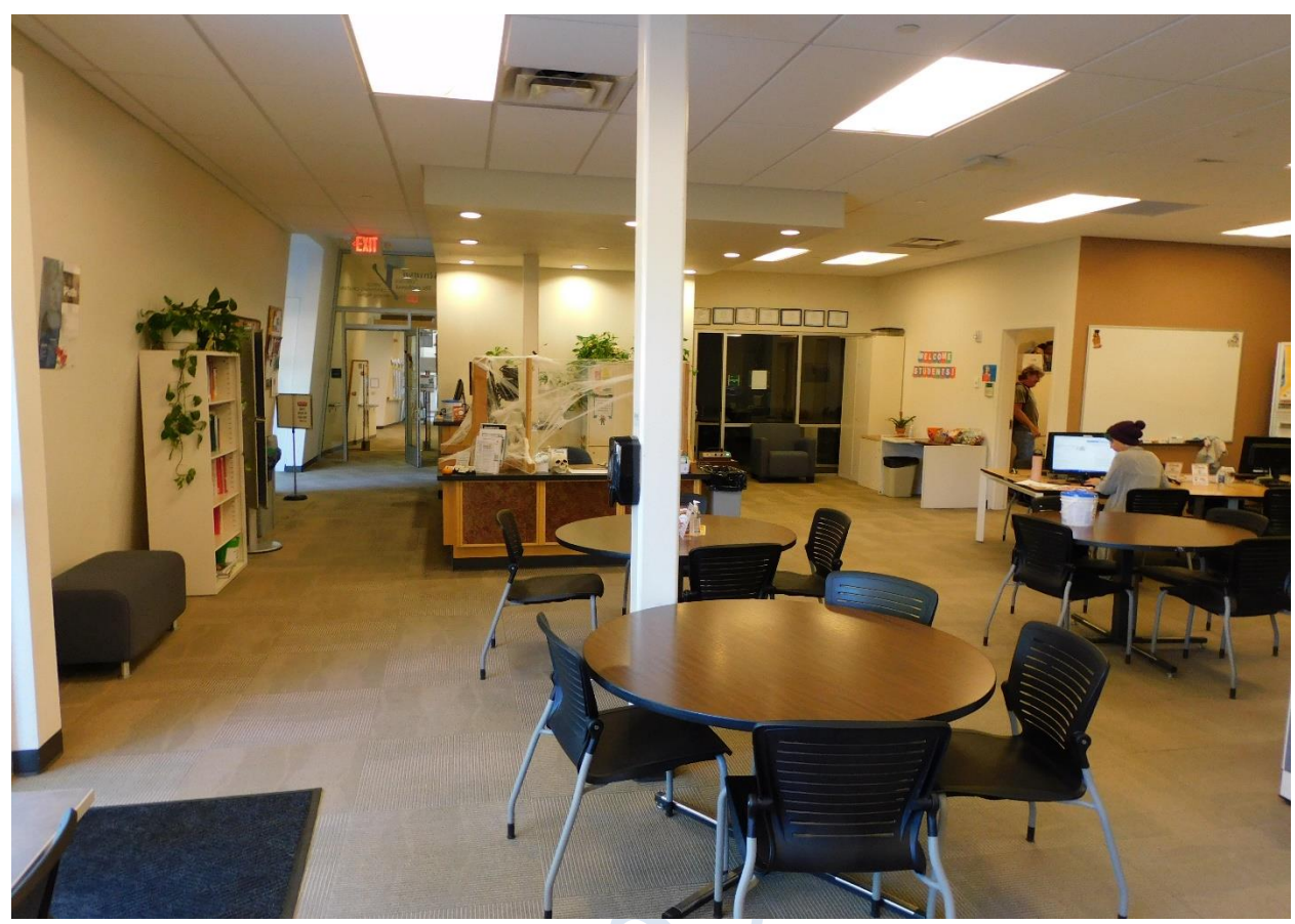
Building M Learning Center

For more information about Yavapai College's Facilities Master Plan, please visit the master plan website: <a href="https://masterplan.yc.edu/">https://masterplan.yc.edu/</a>