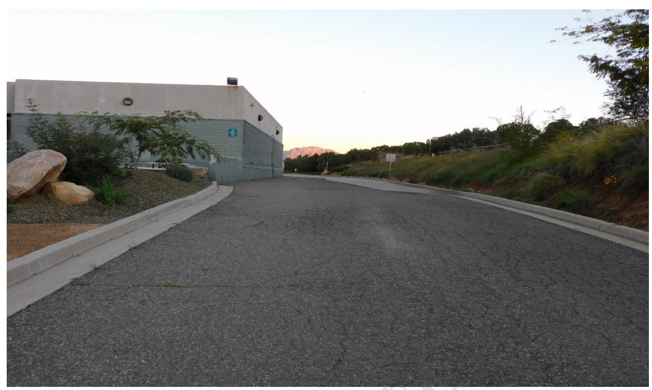
Roadway being replaced behind building 4