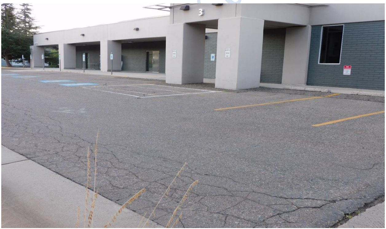
Roadway being replaced behind building 3