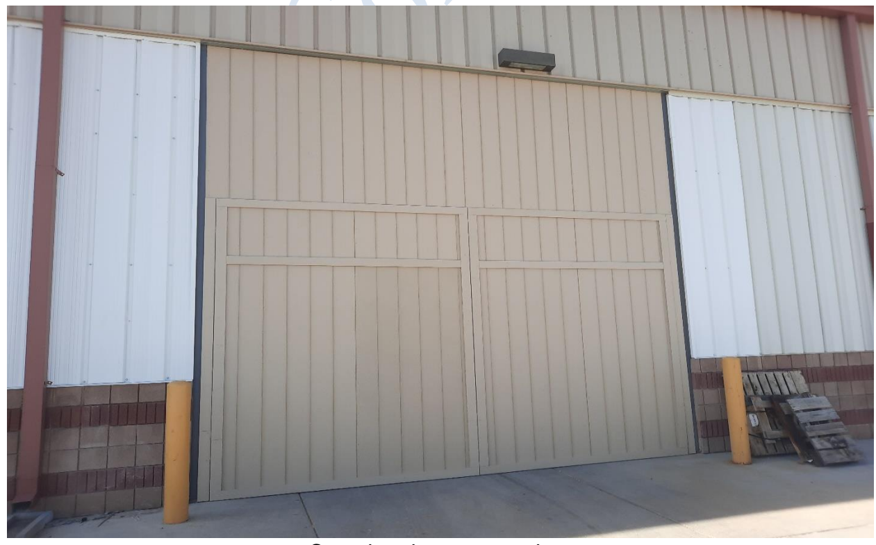
Completed temporary door