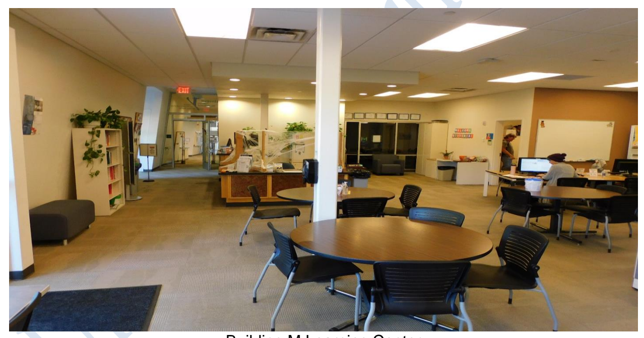
Building M Learning Center

The final draft of the Yavapai College Facilities Master Plan is now available; please visit the master plan website: <a href="https://masterplan.yc.edu/">https://masterplan.yc.edu/</a>