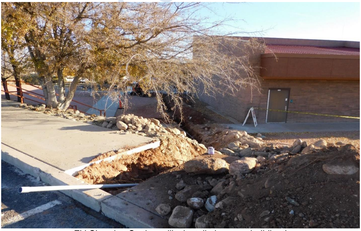
EV Charging Station utility installation near building I

Charging stations are installed on the Prescott campus near buildings 2, 19, and Campus Safety. Charging stations are also being installed near building I on the Verde Valley campus.