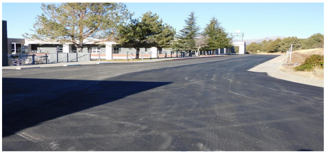
Roadway behind buildings 3 and 4

Buildings 2, 3, and 4 LED Lighting Upgrade – in process through May 2023 Baseball Field Facilities Painting – Purchase order issued Roadway replacement behind Buildings 3 and 4 – October 19 through December 9