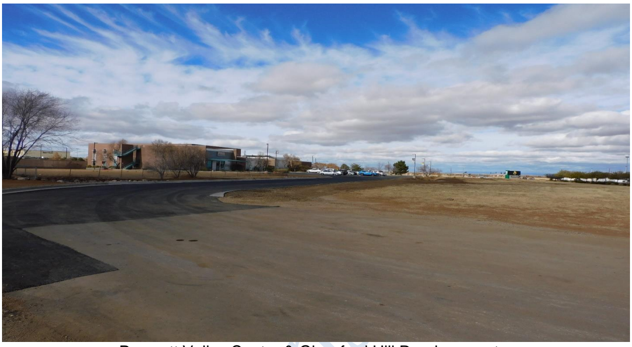
Prescott Valley Center & Glassford Hill Road connector

Construction of the Prescott Valley Center parking lot connector road is complete.