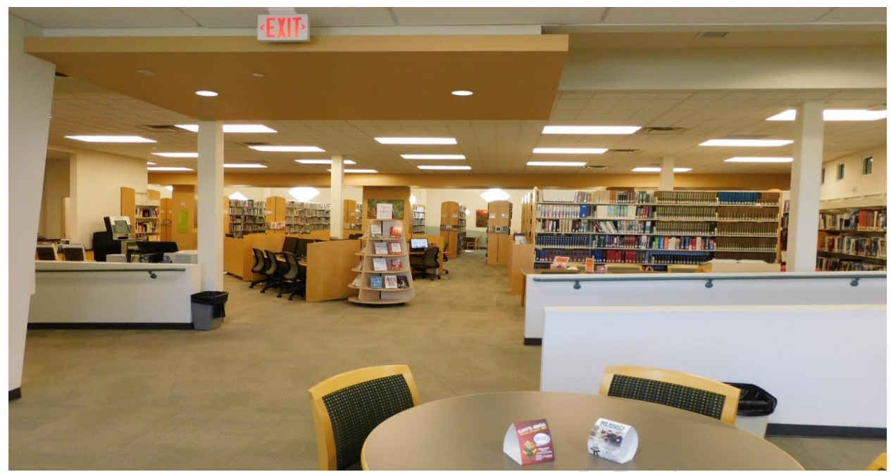
Building M Library