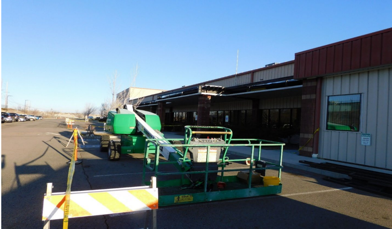
CTEC roof repair and façade replacement

The façade at CTEC is being torn off and replaced to address perpetual leaking in offices. Weather permitting, the leak repairs and façade replacement should be complete by February 15.