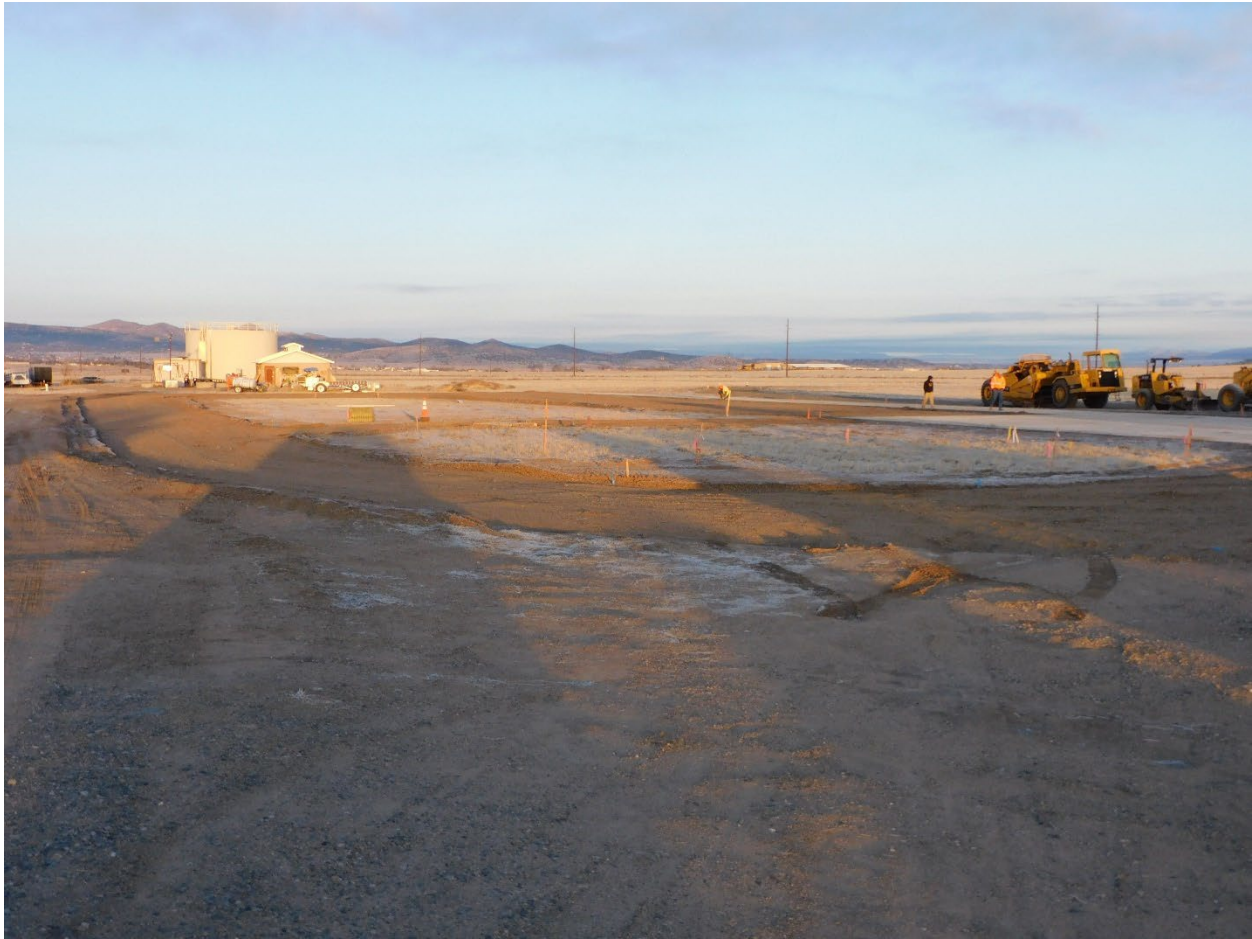
CDL Track under construction at Chino Valley

The final draft of the Yavapai College Facilities Master Plan is now available; please visit the master plan website: https://masterplan.yc.edu/ .