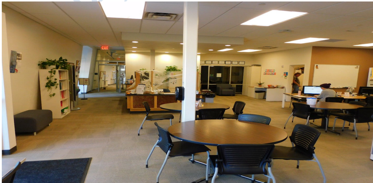
Building M Learning Center