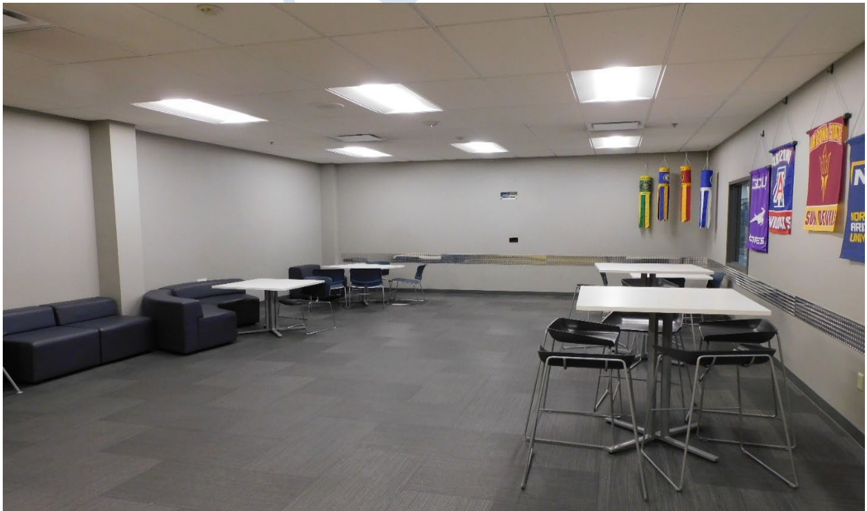
CTEC room 182

Recently, the CTEC dining area was expanded to increase seating capacity freeing up space used as the student lounge. Beginning in January, this space will be remodeled to include much-needed offices, ADA, and tutoring space.