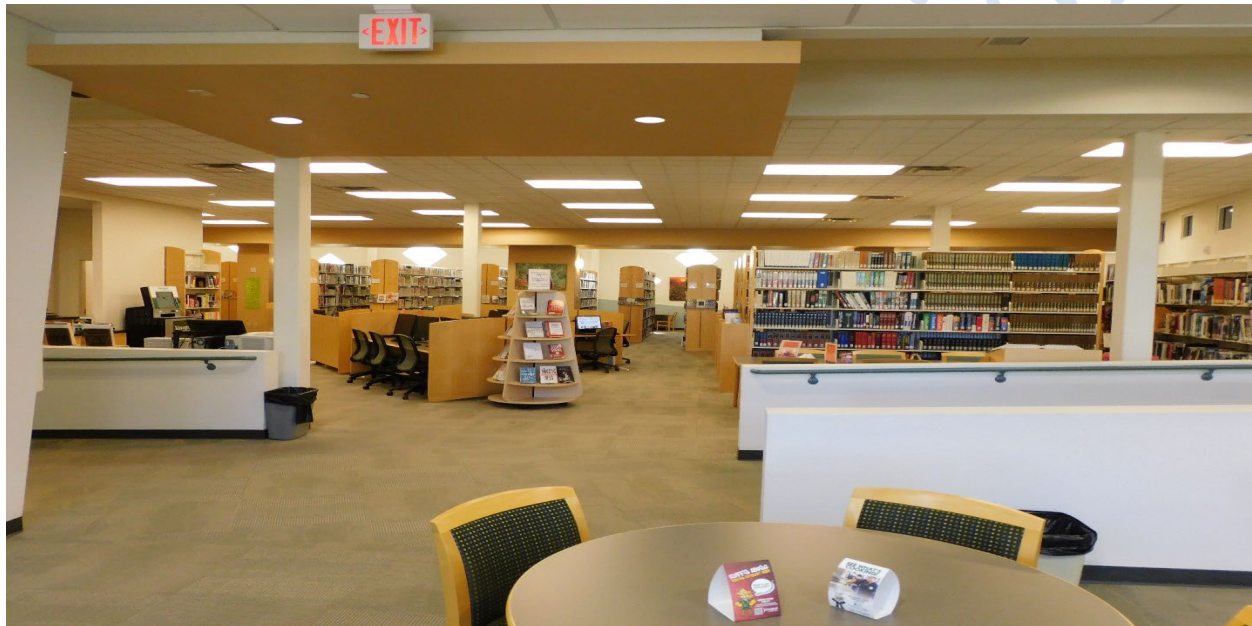
Building M Library