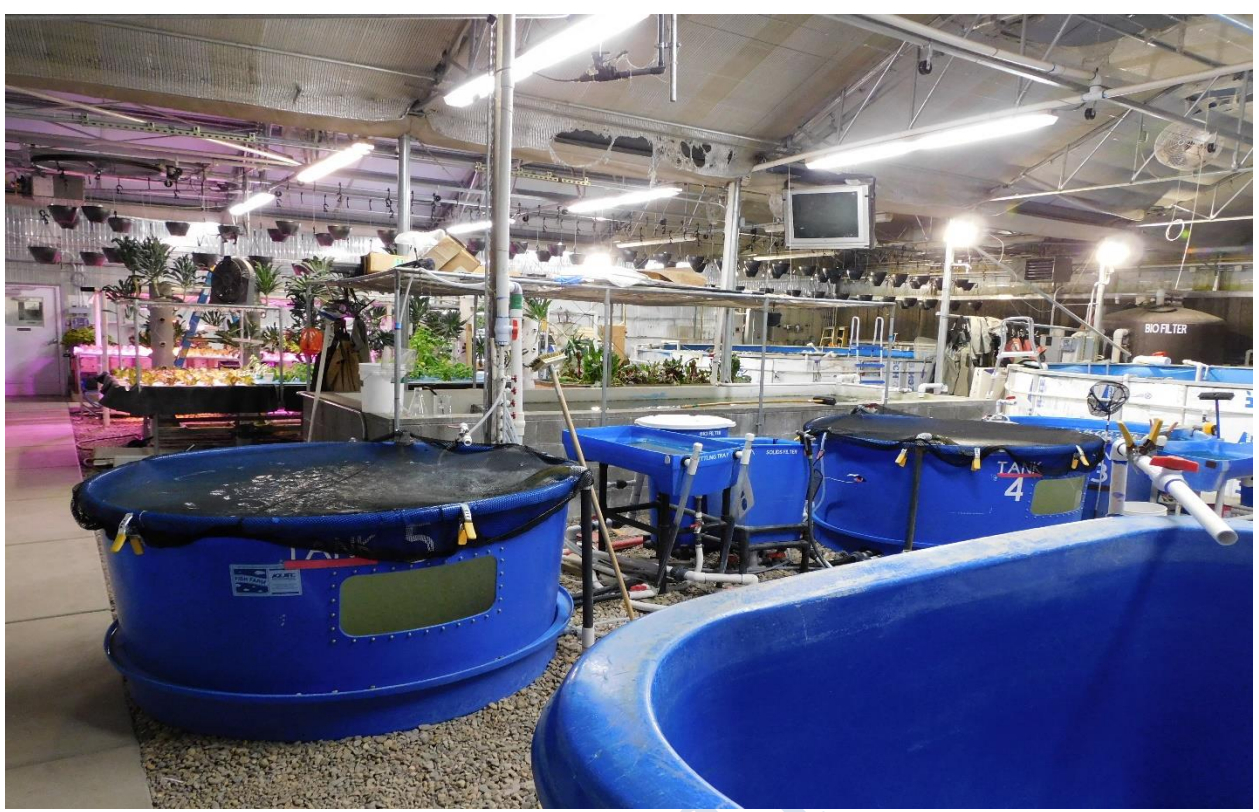
Chino Valley Agribusiness Center greenhouse programs