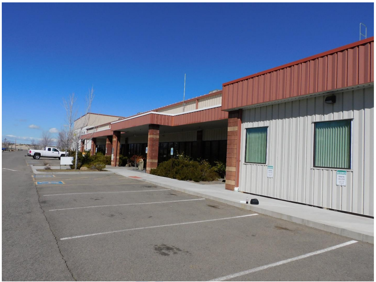
CTEC roof repair and façade replacement

The leak repairs and façade replacement are complete.