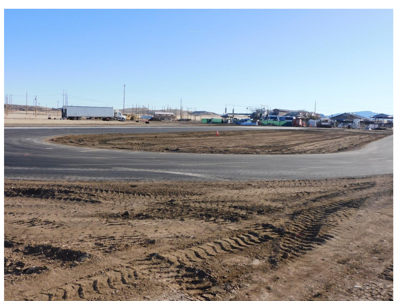
CDL Track at Chino Valley Agribusiness Center