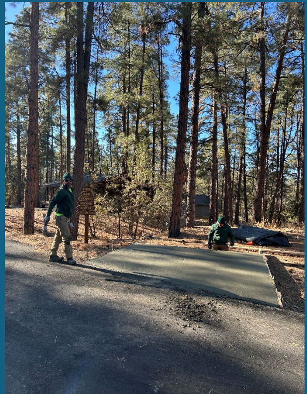
New location for trash dumpster at Prescott Pines

From routine upkeep to remodels, our facilities department is committed to ensuring a safe, efficient, and welcoming environment for all students, faculty, and staff. This includes regular inspections and repairs of electrical systems, plumbing, HVAC, and the general maintenance of our buildings and grounds. Our dedicated team works diligently to promptly address any issues, providing a comfortable and secure campus experience.