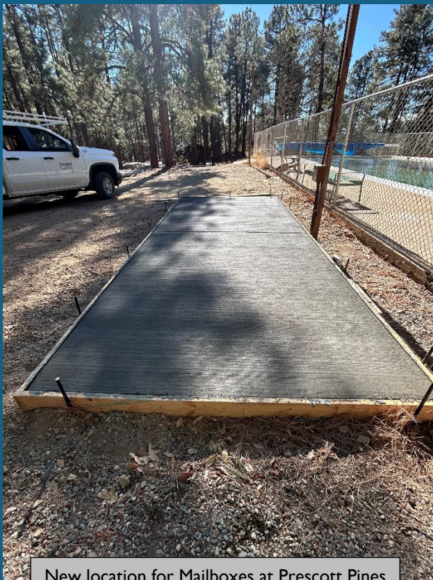
New location for Mailboxes at Prescott Pines