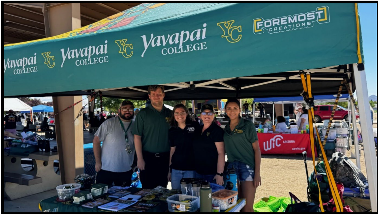
Puente De La Comunidad Prescott Valley Police Department Event