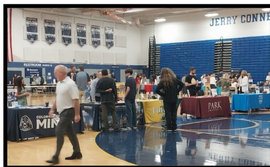
Shadow Mountain High School