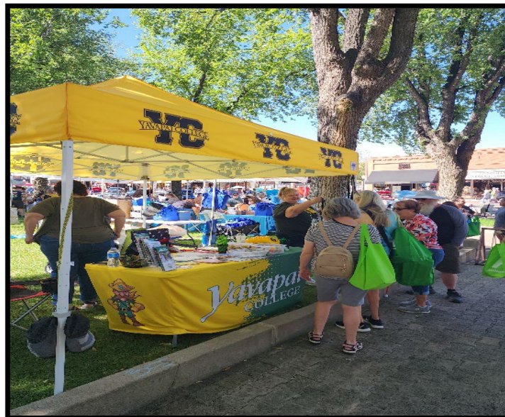
Hope Fest 2024

Hope Fest is an annual community event that offers resources and programs to help families address challenges including education, housing, recovery, domestic violence, mental healthcare and more.