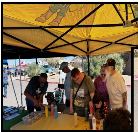
Kids and adults enjoyed sand art!