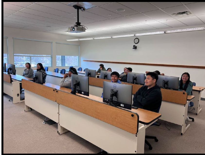
28 students with the NAU Upward Bound students visited YC

The Recruitment department participated in and gave presentations to internal and local area community events, including: