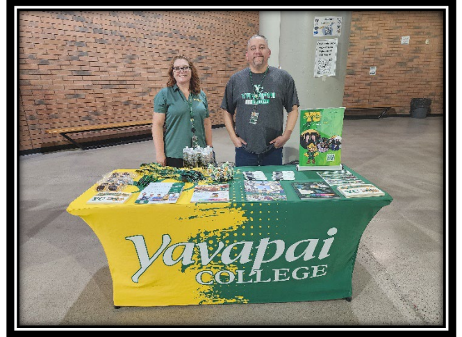
Gilbert High School District College Fair

Recruitment coordinated and assisted with tours on all 6 YC campuses and centers. The team provided tours for 126 individuals during October. Tours included individual or family tours, high school group tours, and YC Athletic Tours.