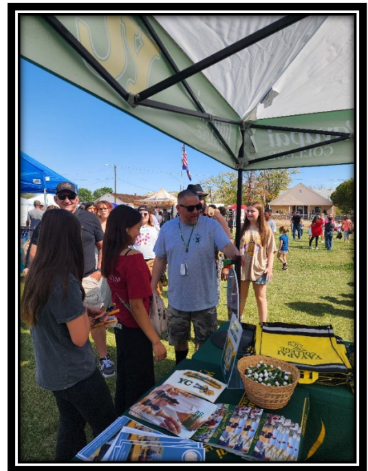
Fort Verde Days