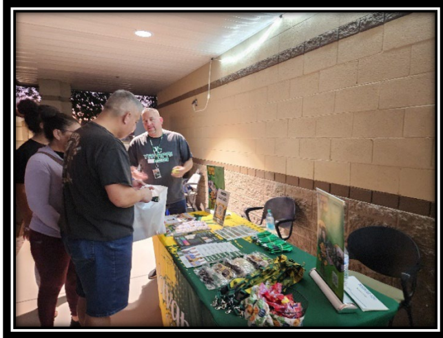
Dysart District CTEC Fair

In October, YC's Recruitment Team provided presentations at 3 Large District College Fairs for Arizona High Schools including single-school or multi-school ACC Fairs.