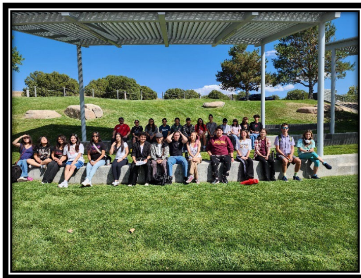
NAU Upward Bound 2 nd Group Tour

Recruitment coordinated and assisted with tours on all 6 YC campuses and centers. The team provided tours for 126 individuals during October. Tours included individual or family tours, high school group tours, and YC Athletic Tours.