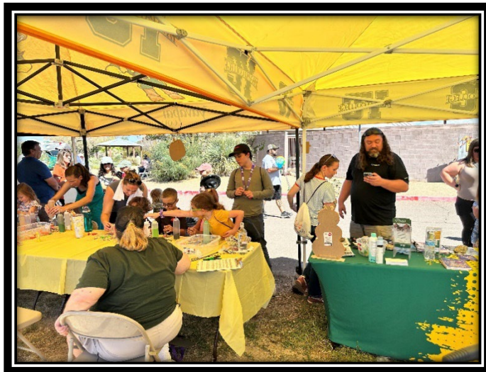
Chino Valley Harvest Fest 2024