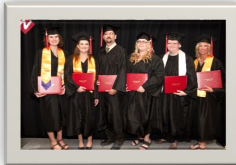
Arts & Humanities