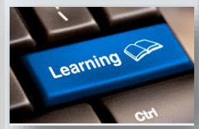
Personal / Professional Development