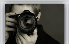
Communication and Creative Arts