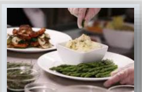
Culinary and Hospitality