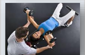
Sports and Fitness