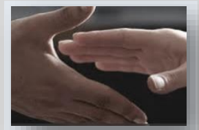
Human and Social Services