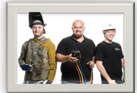
Business & Technical Programs