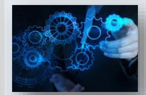
Engineering and Manufacturing