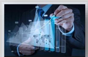
Business and Entrepreneurship