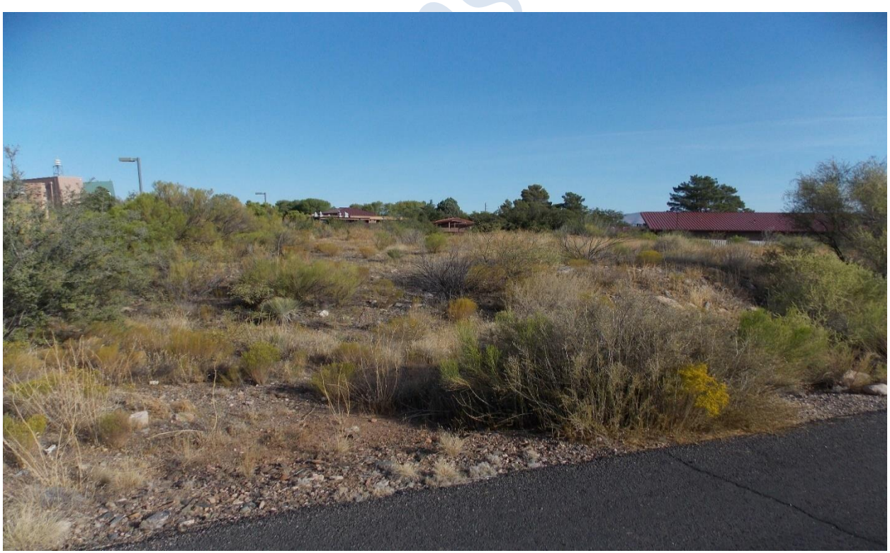
Planned location of the new Verde Valley Skilled Trades Center (Building D)

Design Team: SPS+ Architects Construction Team: McCarthy Building Systems