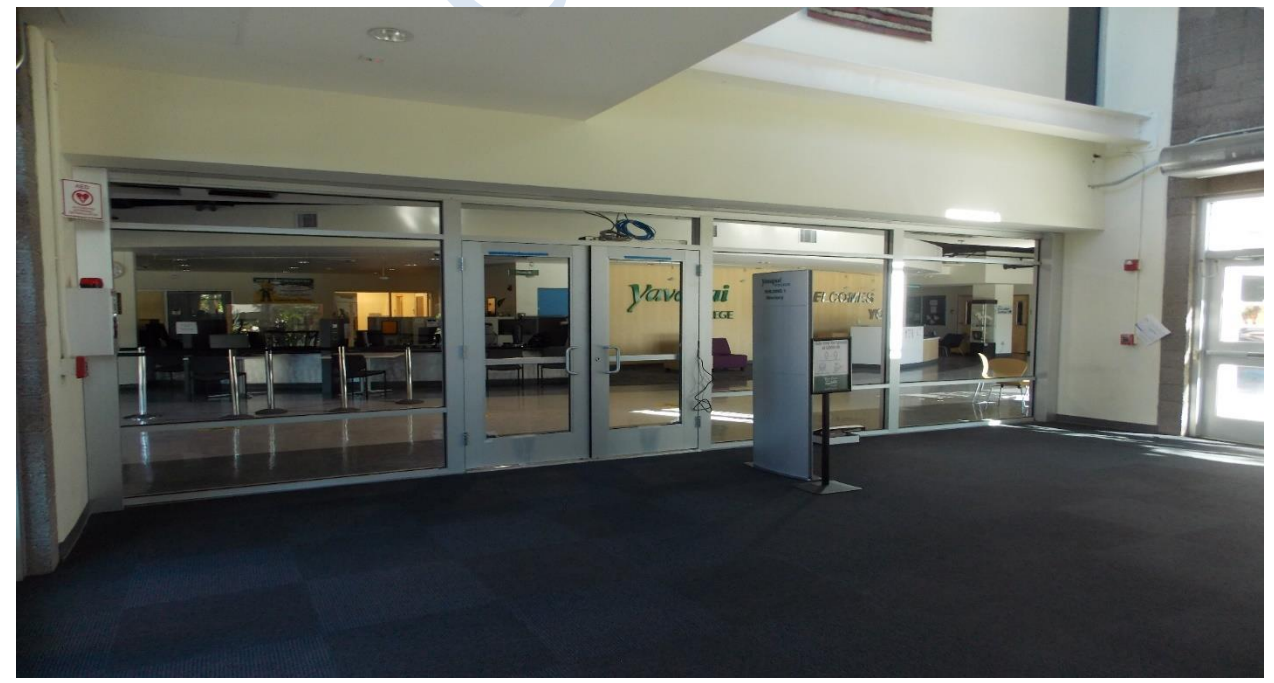
New Vestibule and Entrance Reconfiguration in Building 1

Construction is complete with new storefront glass installed for the new vestibule.