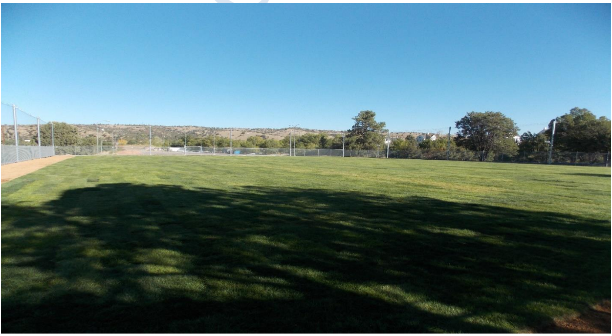
Installation of sod