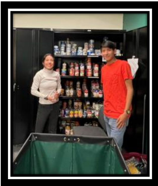
Student Workers filling the shelves back up in Building 1.