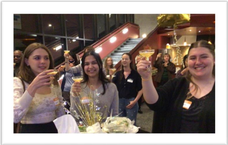
*This program will be piloted this spring semester with 79 YC First-Generation students and kick-off in fall of 2022.