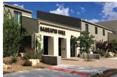
Marapah Residence Hall on the Prescott Campus.

Residence Halls are staffed with on call Resident Assistants each night. Resident Assistants are there to help students, offer programs and help address safety issues. Each student is issued a key for his/her room. For personal safety and security of valuables, students are encouraged to always lock their rooms when leaving. The Campus Safety and Residence Hall Directors offer presentations pertaining to safety and security awareness.