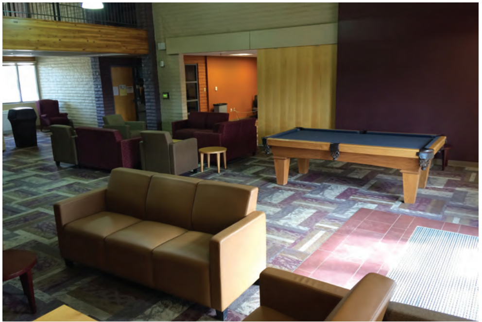
Kachina Residence Hall.