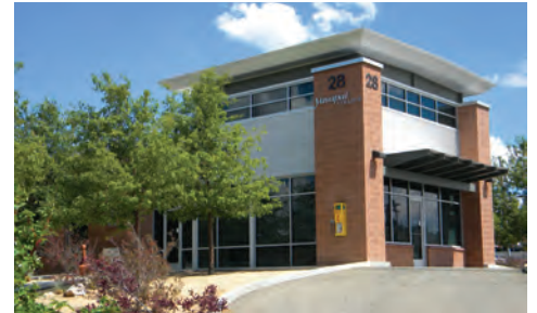
Campus Safety Department is located in Building 28.

The Campus Safety Department on the Prescott Campus is located inside Building 28, which is the first building on the right side of Marston Avenue as you enter from Sheldon Street. The Campus Safety at the Verde Campus is located at the South end of Building F.