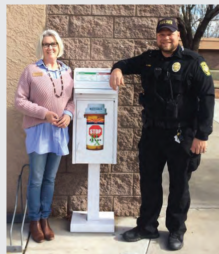
Verde Valley Campus.