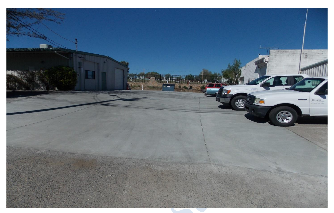
Building 20 Emergency Concrete Project