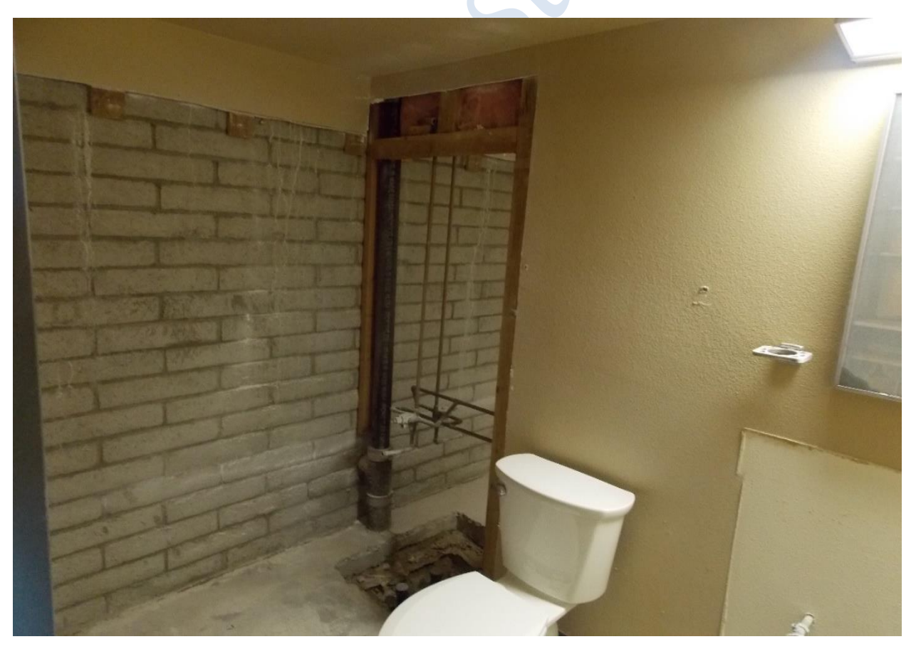
Demolition Work in Typical Resident Hall Restroom

CTEC Roof Coating – Complete Verde Valley Building L Drainage and Central Plant Tie-in – Complete Chino Valley Ag Center and Building 20 Fire Alarm Replacement – Underway Kachina North Wing Plumbing and Fire Safety Upgrades – May through August 2020 Building 2 Fitness Center/Aerobics Room Roof – May 18 through June 2020 Building 19 Roof Replacement – May 18 through June 2020 Sign Replacement at Prescott Valley Center – Complete