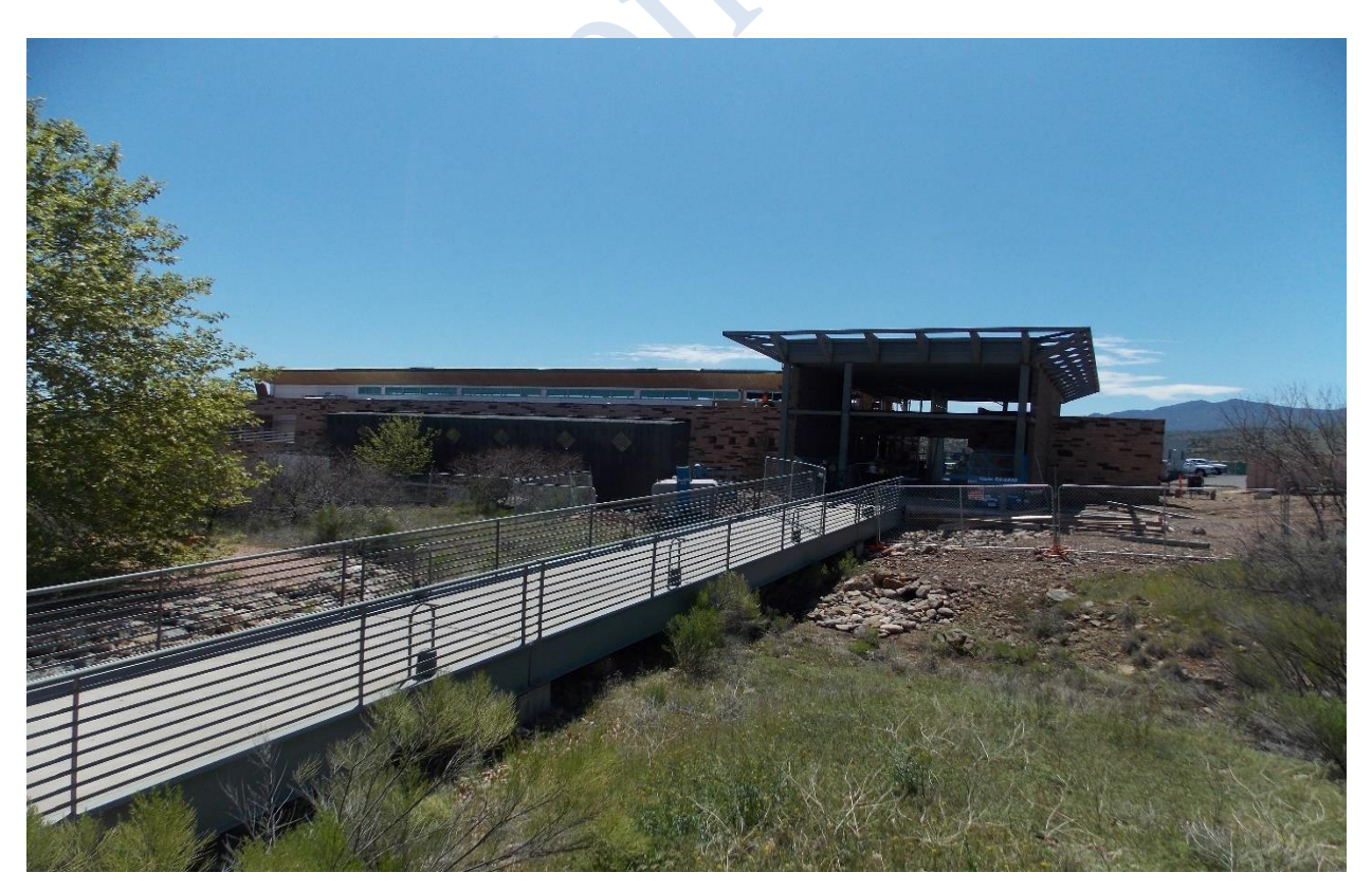
View from Building M