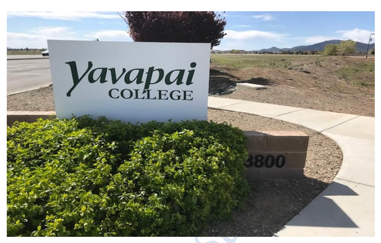
New Sign and Address Designation at the Prescott Valley Center