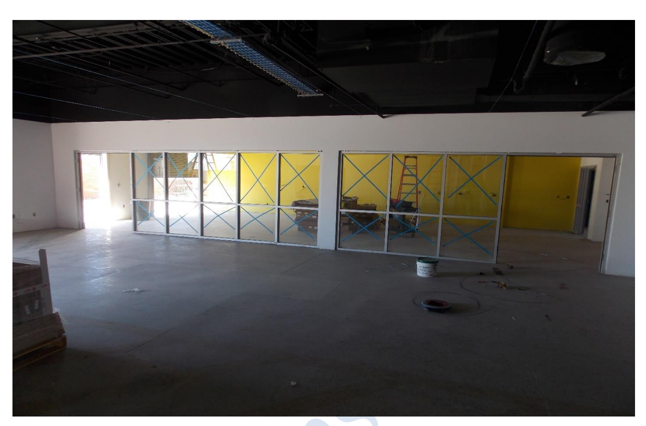
New Glass at Clean Lab