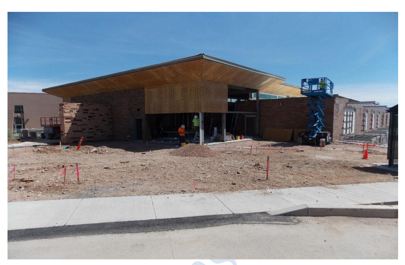
Installing Storefront Glass and Doors for New Front Entry