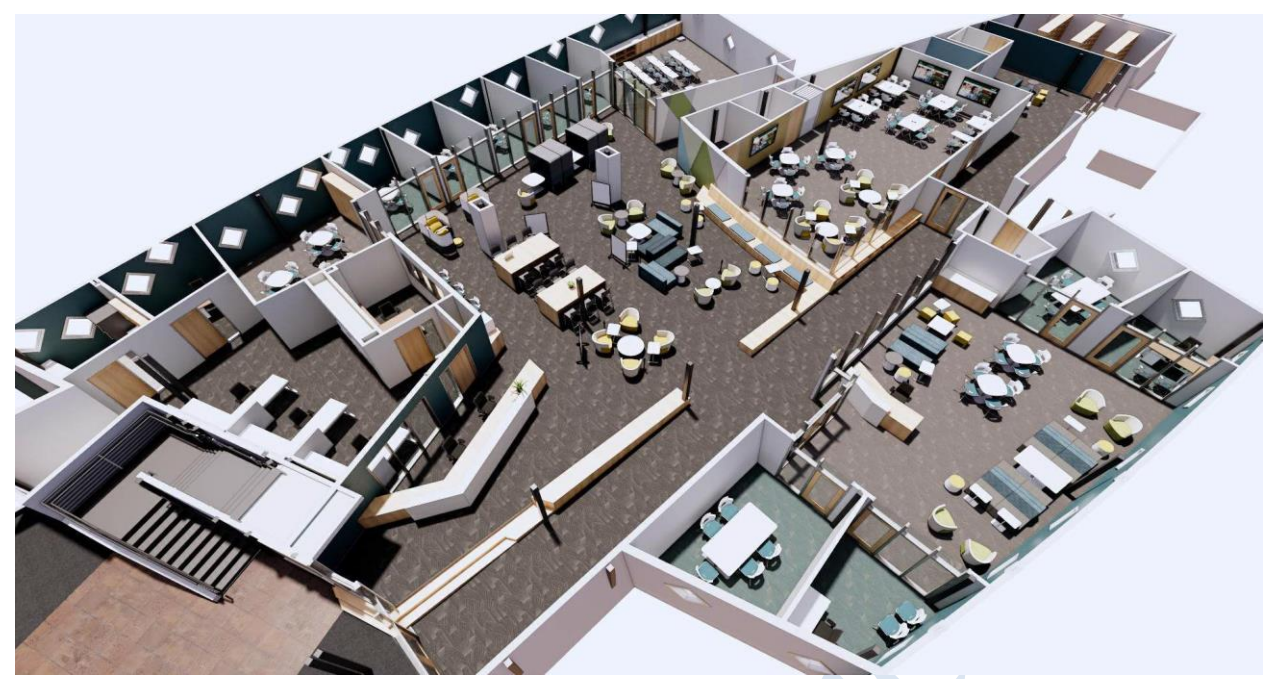
Center for Learning and Innovation – Building M