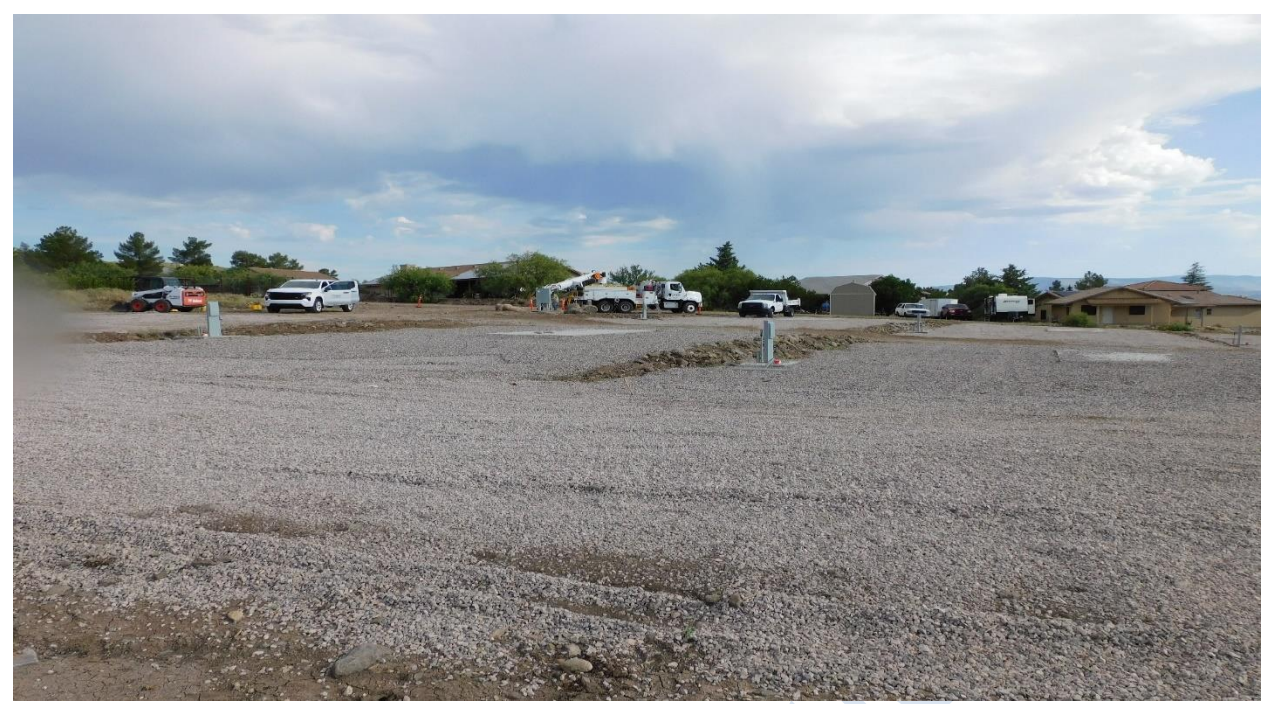
APS installing electrical service to RV pads