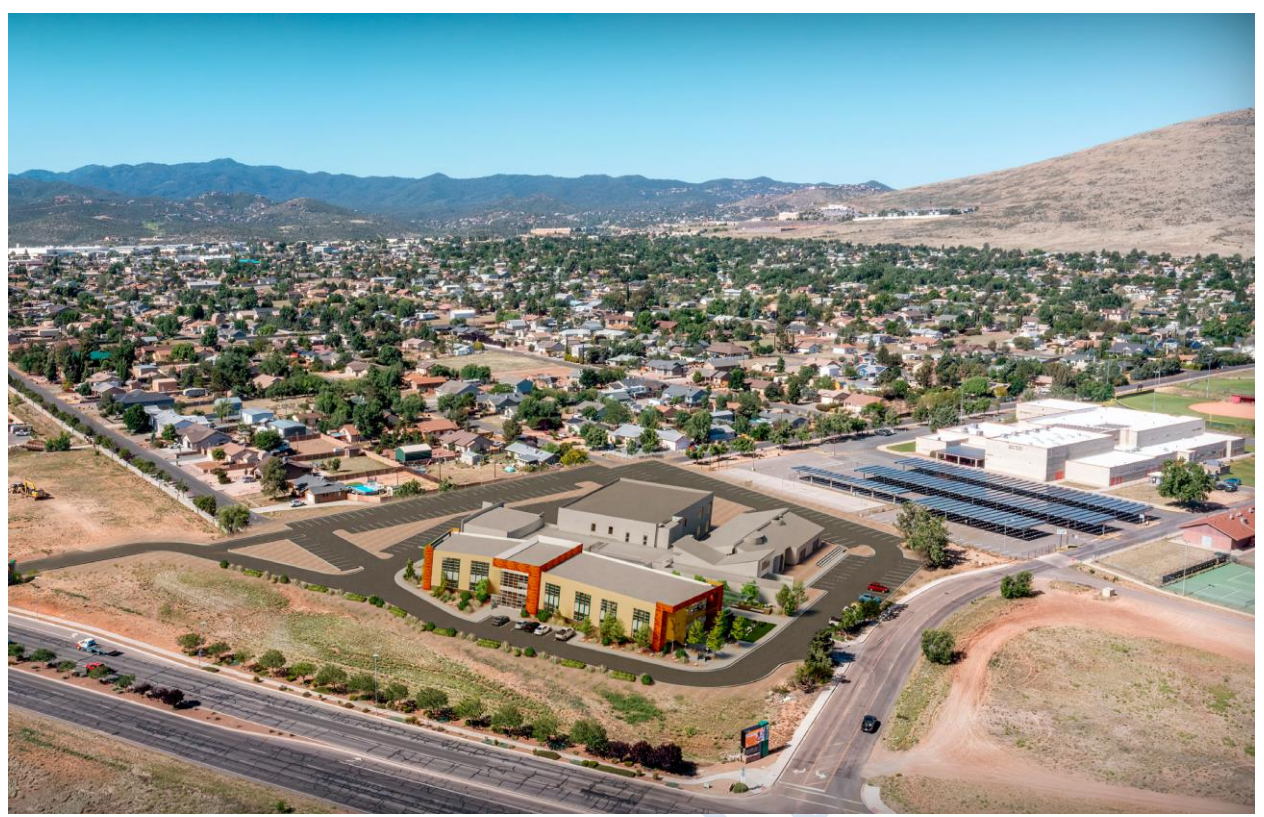
Prescott Valley Center with New Health Sciences Center