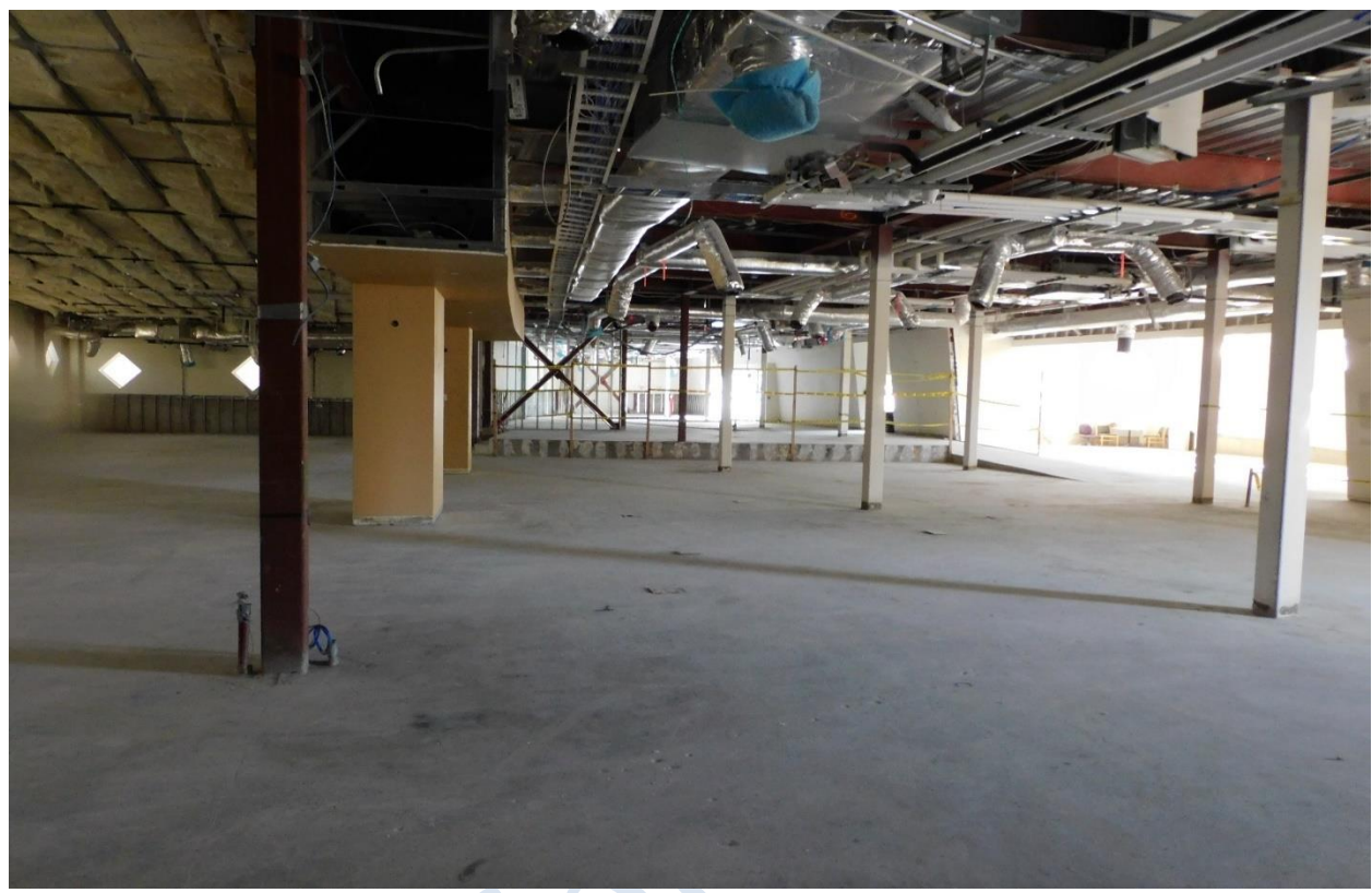
Library Building M

Demolition is complete and construction is underway.