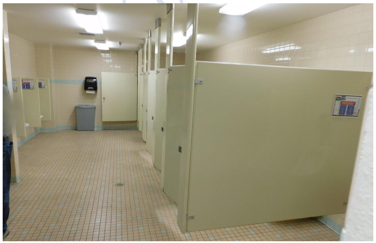
CTEC restroom before rehabilitation