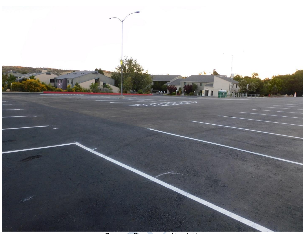
Prescott Campus parking lot L