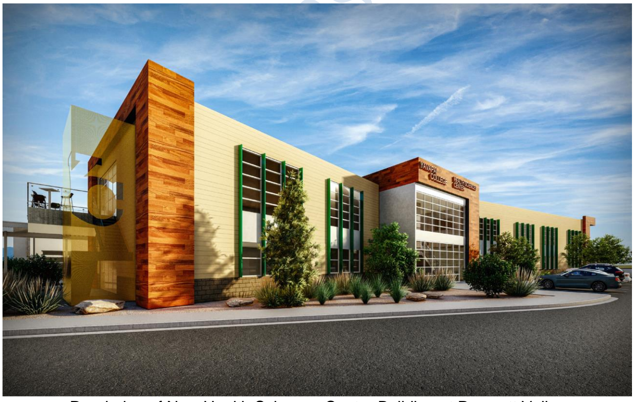
Rendering of New Health Sciences Center Building at Prescott Valley