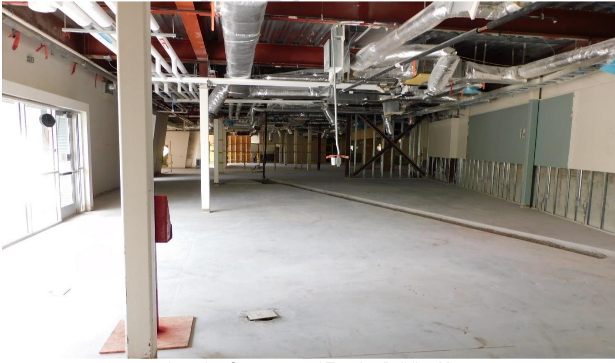
Learning Commons and Tutoring Building M