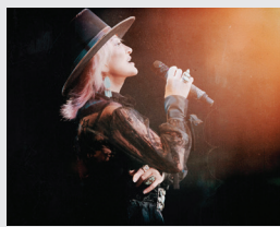
Anchored by Toni Tennille's Dolly! (left), YCPAC's 22-23 season will also feature (top to bottom, right) Big Bad Voodoo Daddy, Tony Orlando and Tanya Tucker.

Toni Tennille, the 70's pop legend and the voice behind the Grammy award-winning hit "Love Will Keep Us Together," will make a triumphant return from retirement this fall to portray the title character in an iconic American musical in her Prescott home. Don't miss Toni Tennille in Yavapai College Performing Arts Center's production of Hello, Dolly! November 3-20.