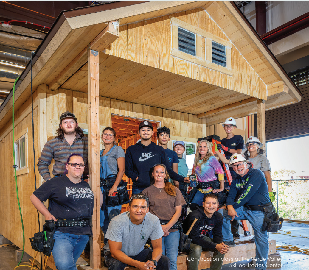
Construction class at the Verde Valley Skilled Trades Center