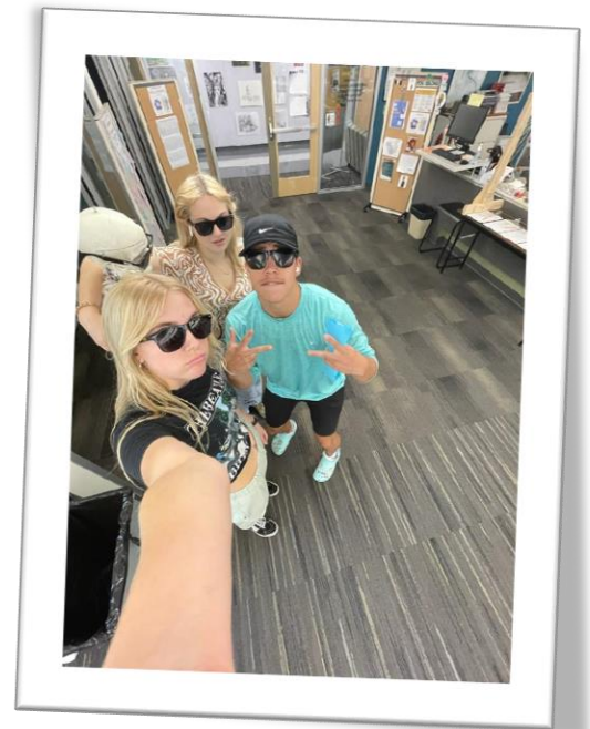
EC Academy students on campus and at the learning center