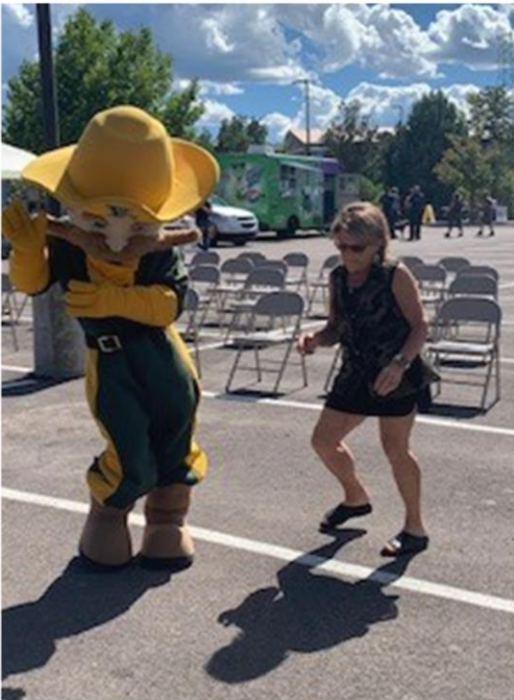
Ruff joins in on the dancing!