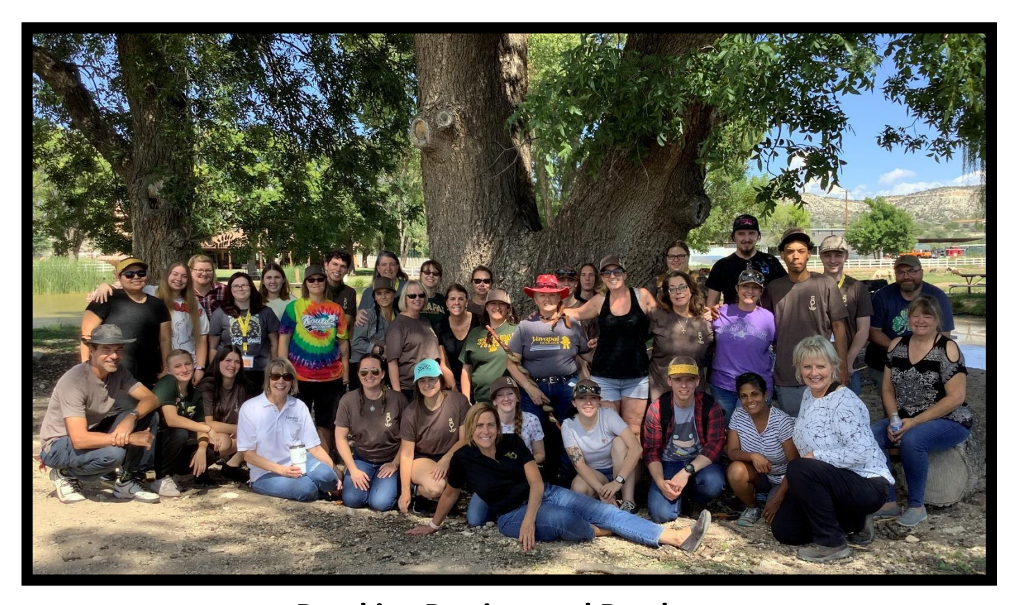
Breaking Barriers and Ready to Ride